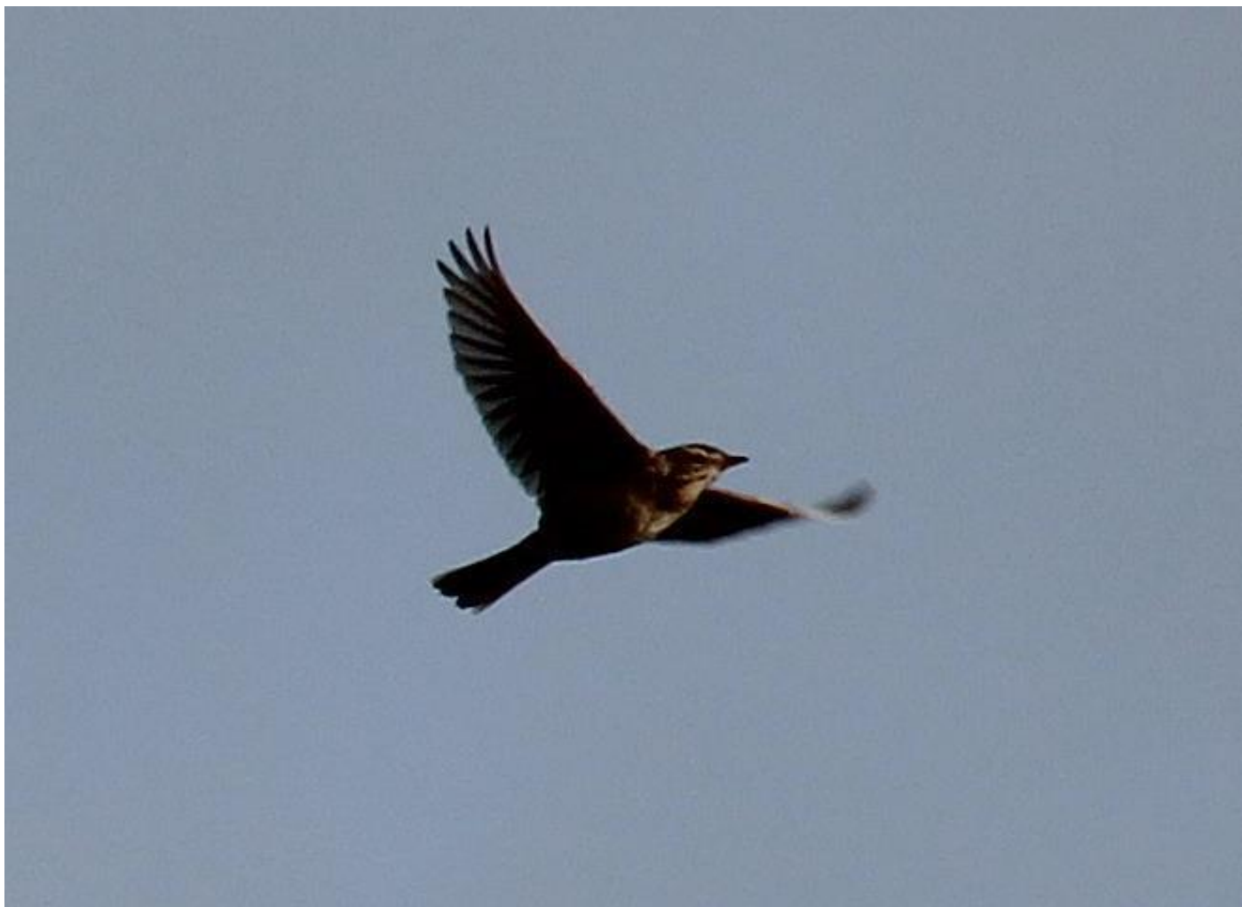
Richard's Pipit at Abbotscliffe