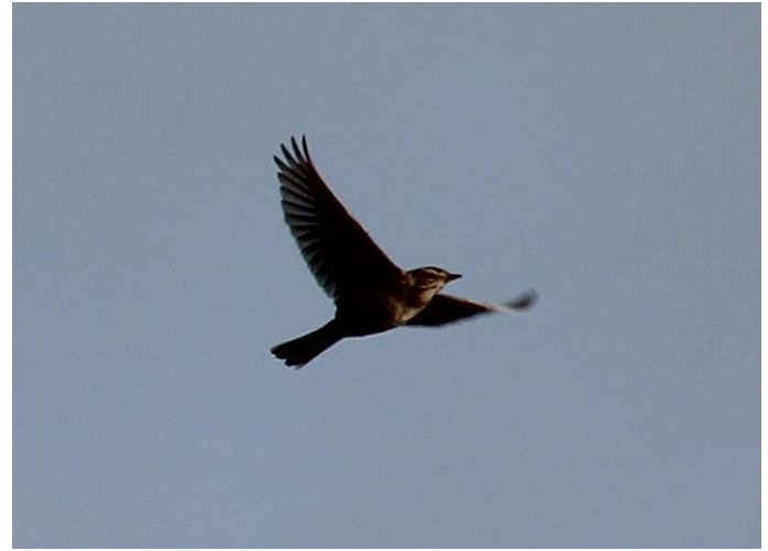
Richard's Pipit at Abbotscliffe

A rare but regular passage migrant to Kent, particularly in the autumn. There had been 119 county records to the end of 2010, 55% of which were in the last twenty years.