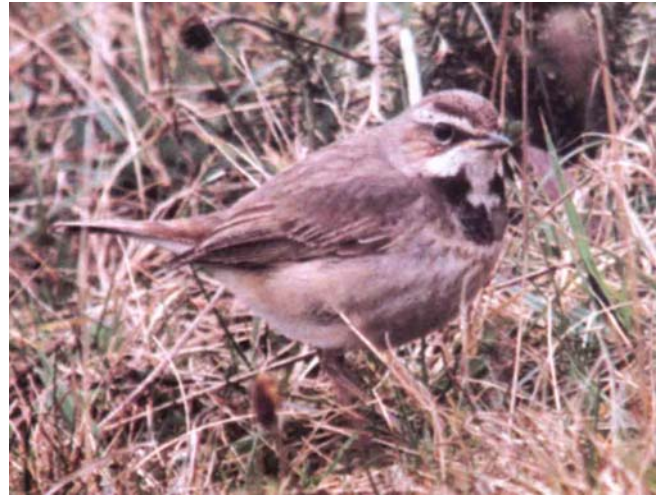
Bluethroat at Abbotscliffe

The south-western races, cyanecula (breeding in Spain and central Europe, eastwards from Belgium and eastern France) and namnetum (breeding in western France), winter in Africa, and return northwards early in spring, from late February or early March. The nominate northern form (breeding in Scandinavia eastwards into northern Russia), winters patchily right across the Mediterranean and over the entire African winter range of the species, and heads north somewhat later, into May.