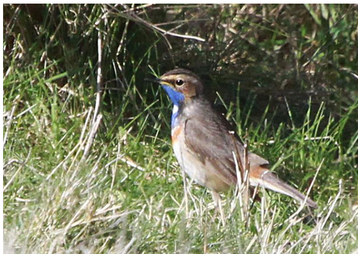
Bluethroat at Samphire Hoe (Paul Holt)