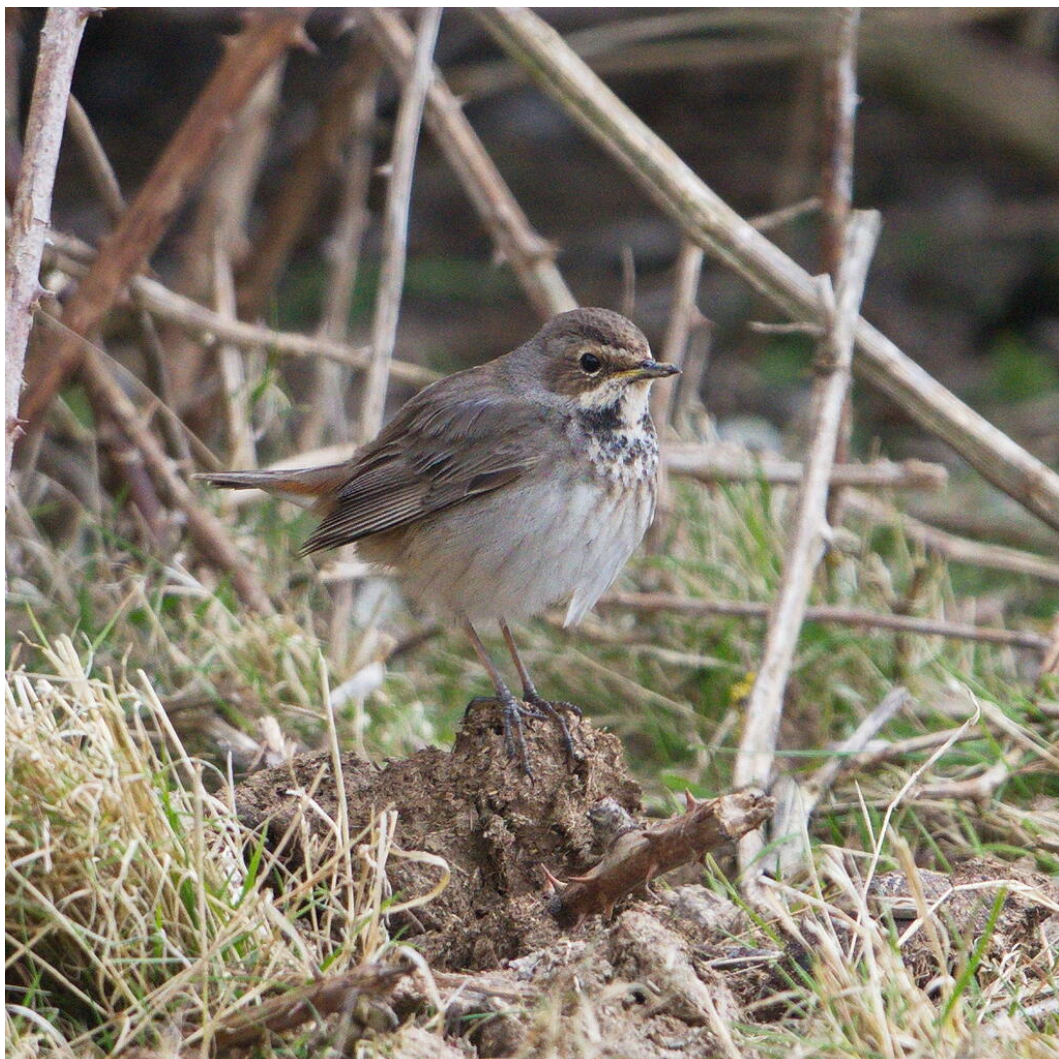
Bluethroat at Samphire Hoe (Paul Rowe)