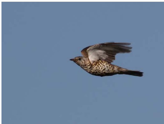
Mistle Thrush at Pond Hill Road, Cheriton (Brian Harper)

The full species account will follow but the breeding and wintering distribution maps based on the 2007 – 2012 BTO / KOS atlas are provided below.