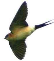
Red-rumped Swallows at Capel-le-Ferne (Dale Gibson)

An account of the first area record is given below: