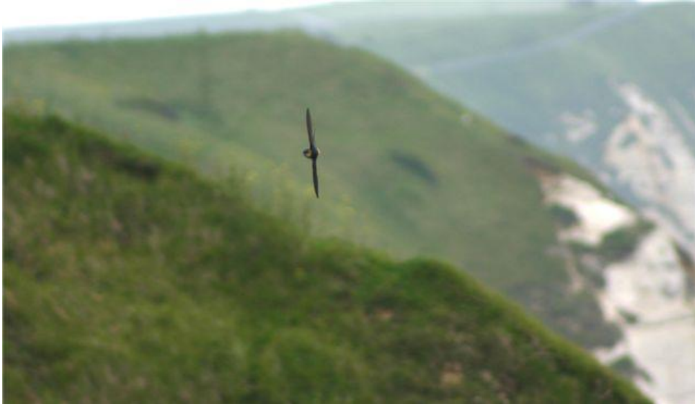
Red-rumped Swallow at Capel-le-Ferne (Dale Gibson)

The record was accepted by the British Birds Rarities Committee and appears in their annual rarity report for 1992 (p. 30). There had been 20 previous records in Kent and 231 nationally.