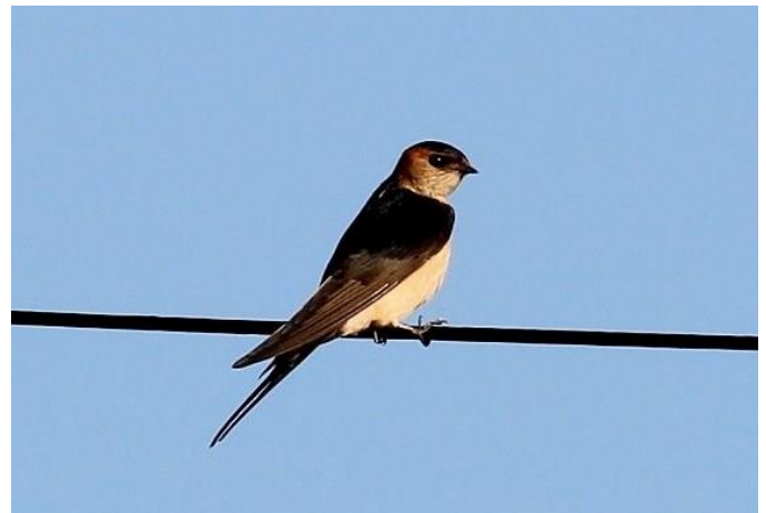
Red-rumped Swallow at Capel-le-Ferne

First recorded in Kent in 1959, there had only been another eight county records until the mid-1980s after which this attractive hirundine began to arrive more regularly. Of the 57 records in Kent to the end of 2009, 75% occurred in the last two decades.