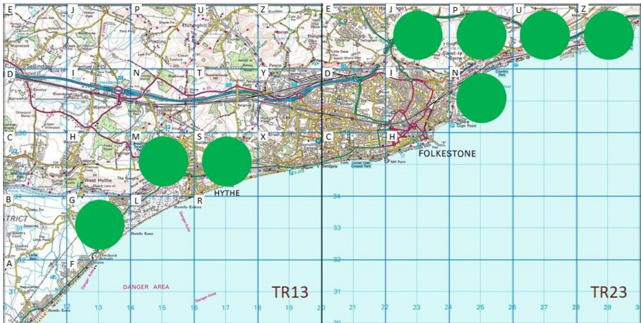
Figure 3: Distribution of all Red-backed Shrike records at Folkestone and Hythe since 1980 by tetrad

Figure 3 shows the distribution of records by tetrad.