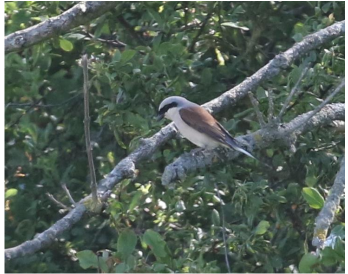
Red-backed Shrike at Hythe Roughs (Ian Roberts)

Breeds across much of Europe, but has almost disappeared from Britain (not breeding annually), and has contracted its range in Belgium, the Netherlands, Denmark and Iberia. Elsewhere its numbers have greatly reduced in many areas, without an apparent reduction in range. The decline is thought to probably be due to loss and fragmentation of habitat resulting from afforestation and agricultural intensification, with increased use of pesticides causing loss of food resources, and climatic change. Winters in eastern tropical and southern Africa (Snow & Perrins, 1998).