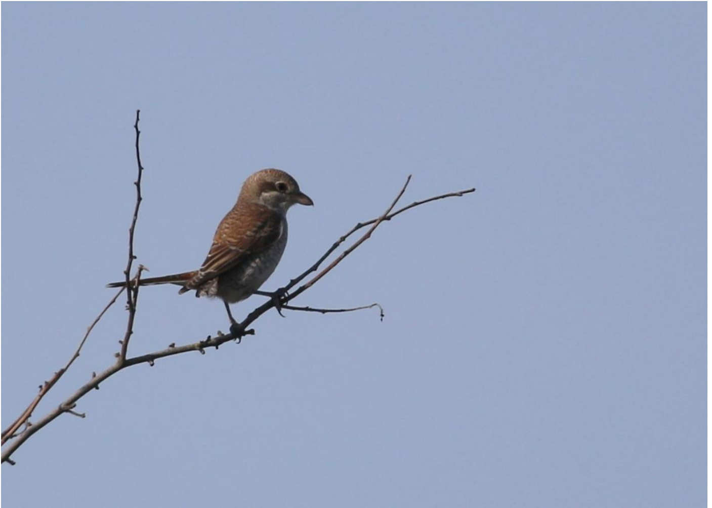
Red-backed Shrike at Abbotscliffe

The tetrad map images were produced from the Ordnance Survey Get-a-map service and are reproduced with kind permission of Ordnance Survey .