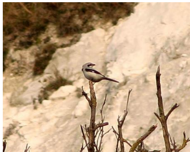
Great Grey Shrike at Samphire Hoe (Dale Gibson)

Breeds across central Europe from France eastwards into Russia, also in Fenno-Scandia. Extreme northern populations vacate the breeding areas completely, and some southern populations are apparently sedentary; other populations consist of long-distance migrants, short distance migrants and sedentary birds. The winter range includes most of mid-latitude Europe from Britain (where scarce) eastwards, and south-eastwards as far as Turkey.