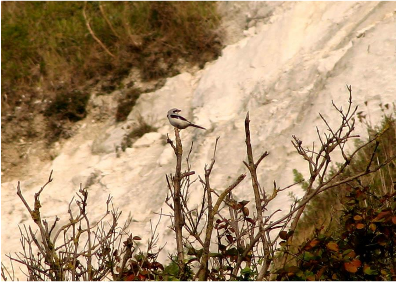
Great Grey Shrike at Samphire Hoe (Dale Gibson)