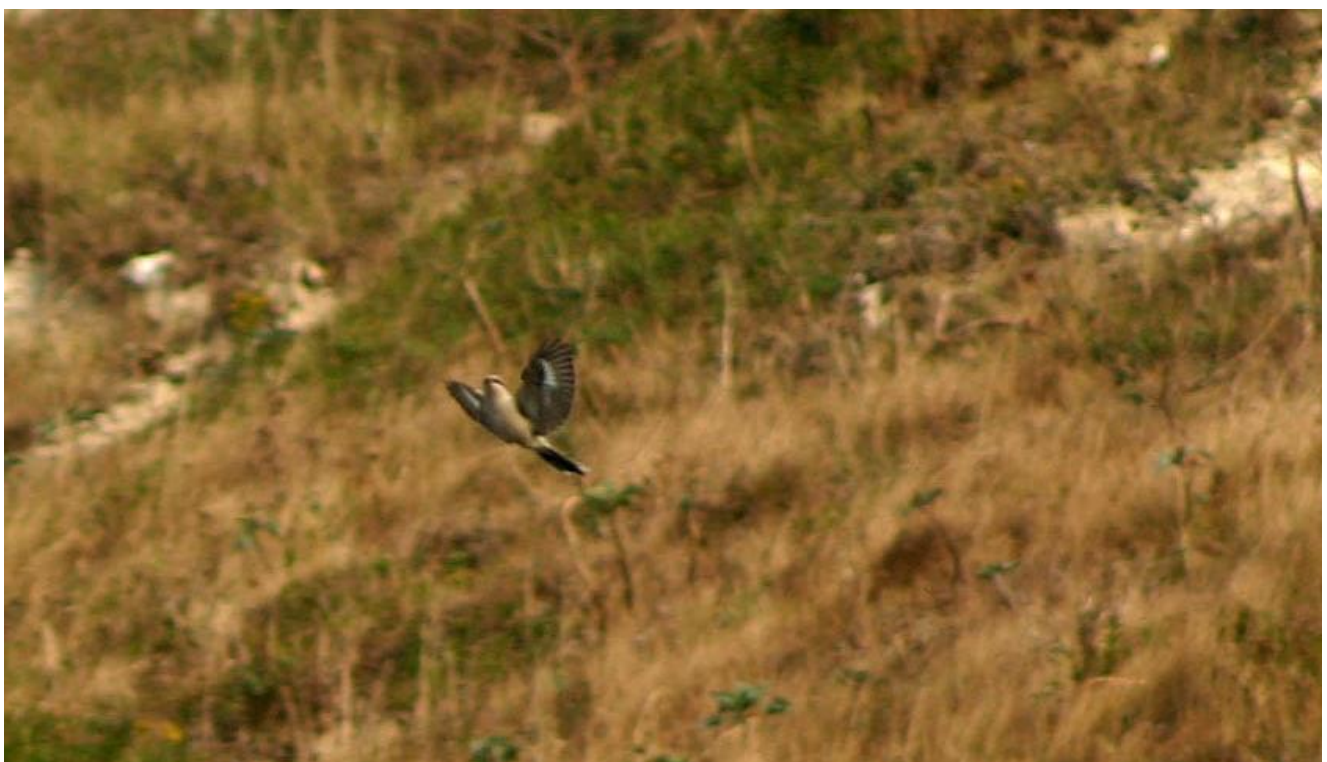
Great Grey Shrike at Samphire Hoe (Dale Gibson)