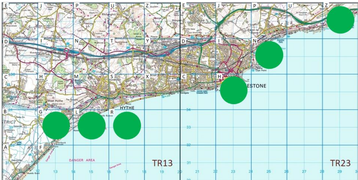
Figure 3: Distribution of all Balearic Shearwater records at Folkestone and Hythe by tetrad

Figure 3 shows the distribution of records by tetrad.