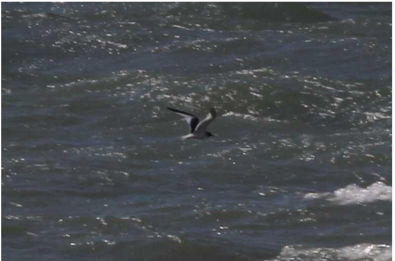
Sabine's Gull at Copt Point (Ian Roberts)