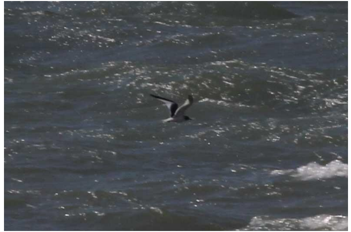
Sabine's Gull at Copt Point (Ian Roberts)

Breeds in Greenland and eastern Canada, then migrates south-east across the open Atlantic towards Iberia and western Morocco before turning south and heading into the South Atlantic to winter off southern Africa. Present in European inshore waters mainly after westerly gales and in Britain occurs mainly in the Western Approaches, chiefly mid-August to mid-November.