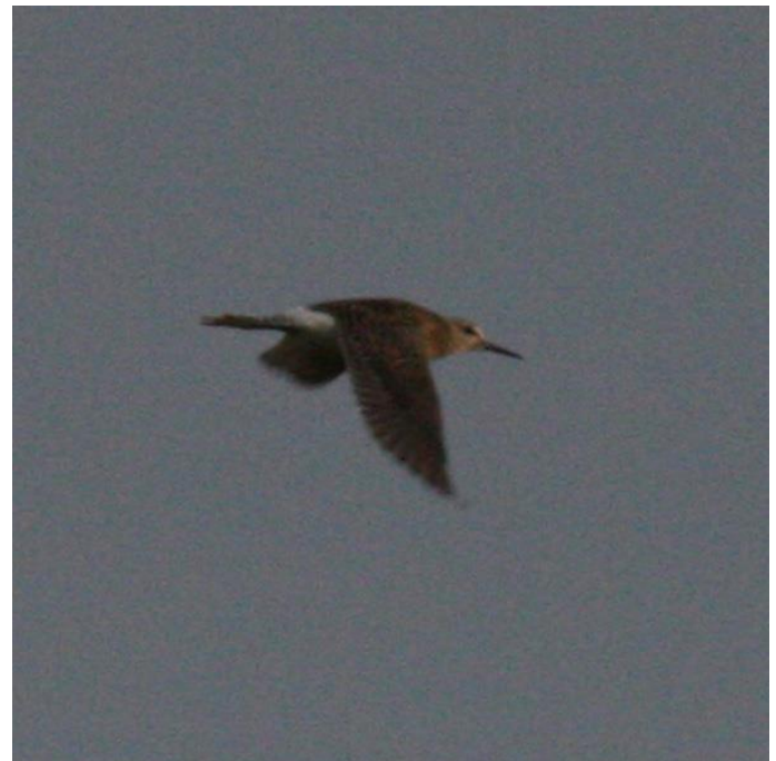
Wood Sandpiper at Nickolls Quarry (Brian Harper)

First recorded at Folkestone and Hythe at Nickolls Quarry in the 1950s, when there were a total of seven records to 1961 involving ten birds, with two in spring and five in autumn. There followed a thirty year gap until the next in 1992, but then the species occurred with some regularity, including records in five consecutive years from 2000, as shown in figure 1.