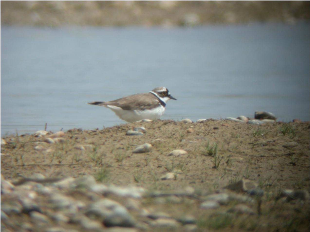
Little Ringed Plover at Nickolls Quarry