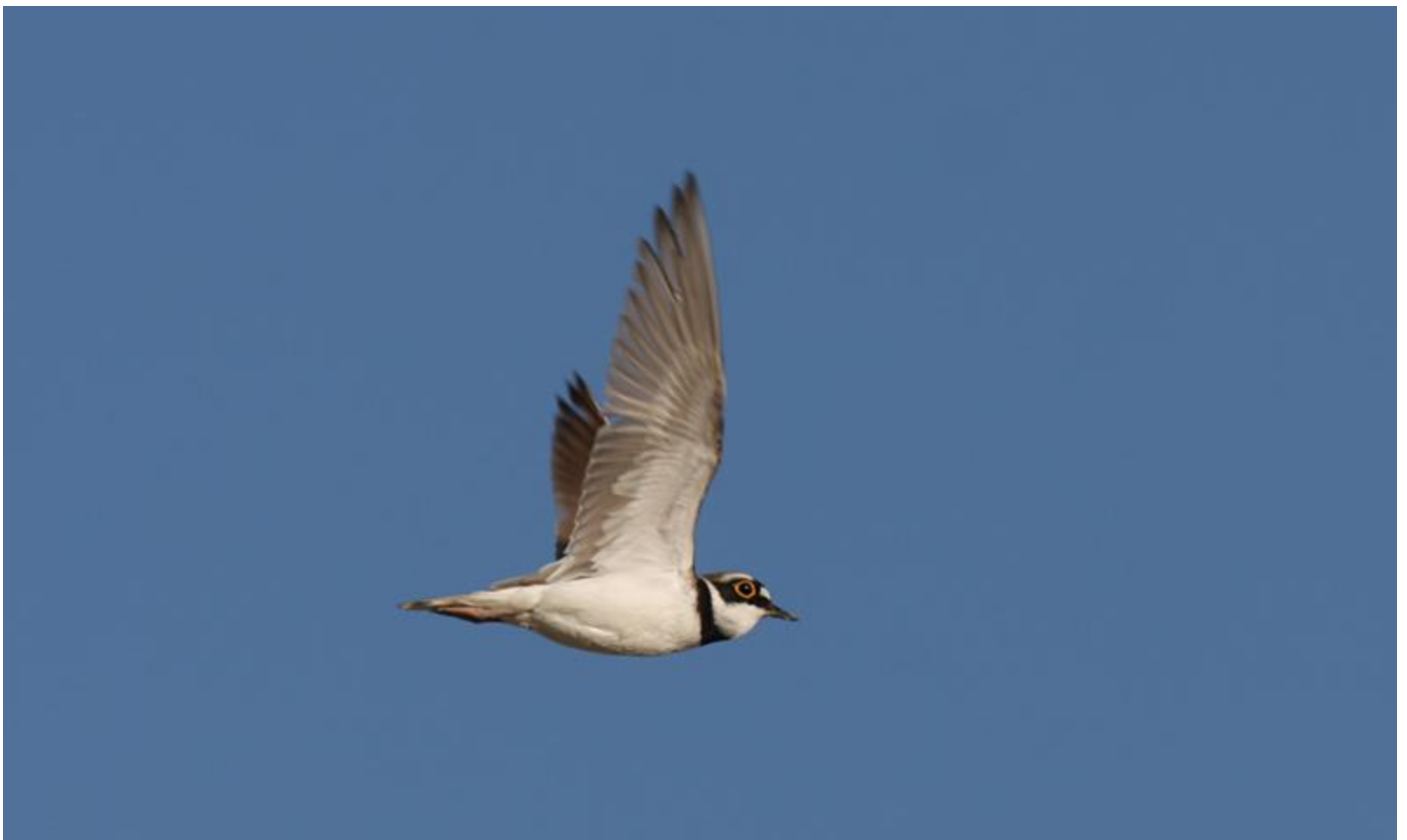
Little Ringed Plover at Nickolls Quarry (Brian Harper)