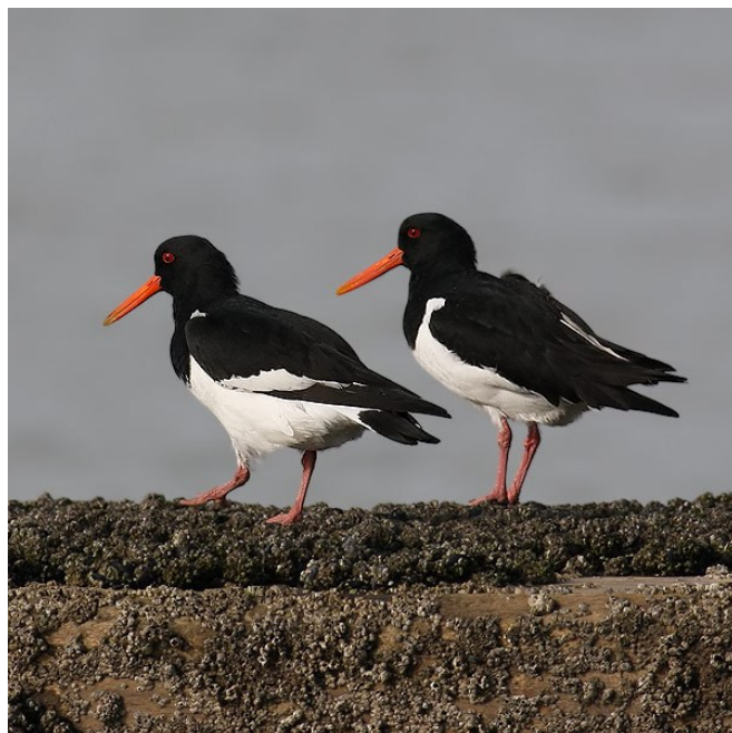
Oystercatchers at Hythe Redoubt

The full species account will follow but the breeding and wintering distribution maps based on the 2007 – 2012 BTO / KOS atlas are provided below.