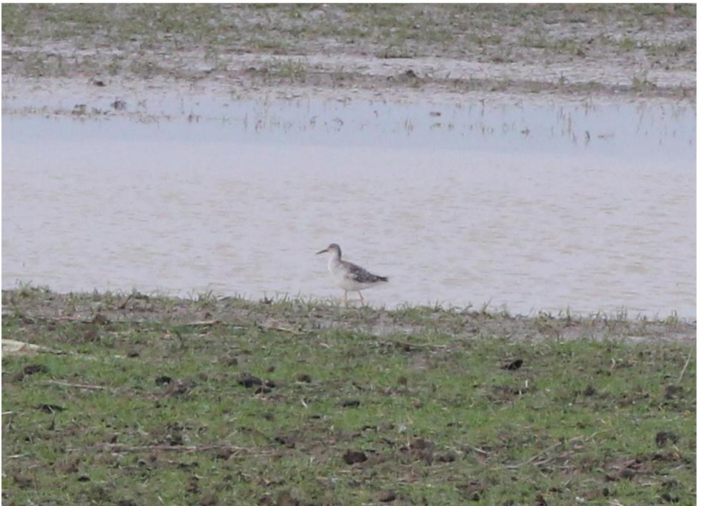
Ruff at the Willop Basin