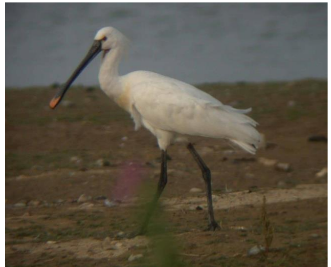
Spoonbill at Nickoll’s Quarry (Ian Roberts)

Has a scattered breeding distribution across mainly southern Europe, though with a reasonable population as far north as the Netherlands. Winters in Mediterranean basin and northern tropical Africa. An occasional breeder in Britain including at one site in Norfolk in 2010 where six pairs bred, raising 10 young. A summering bird was present in Kent in the same year, where it is an annual visitor in small numbers.