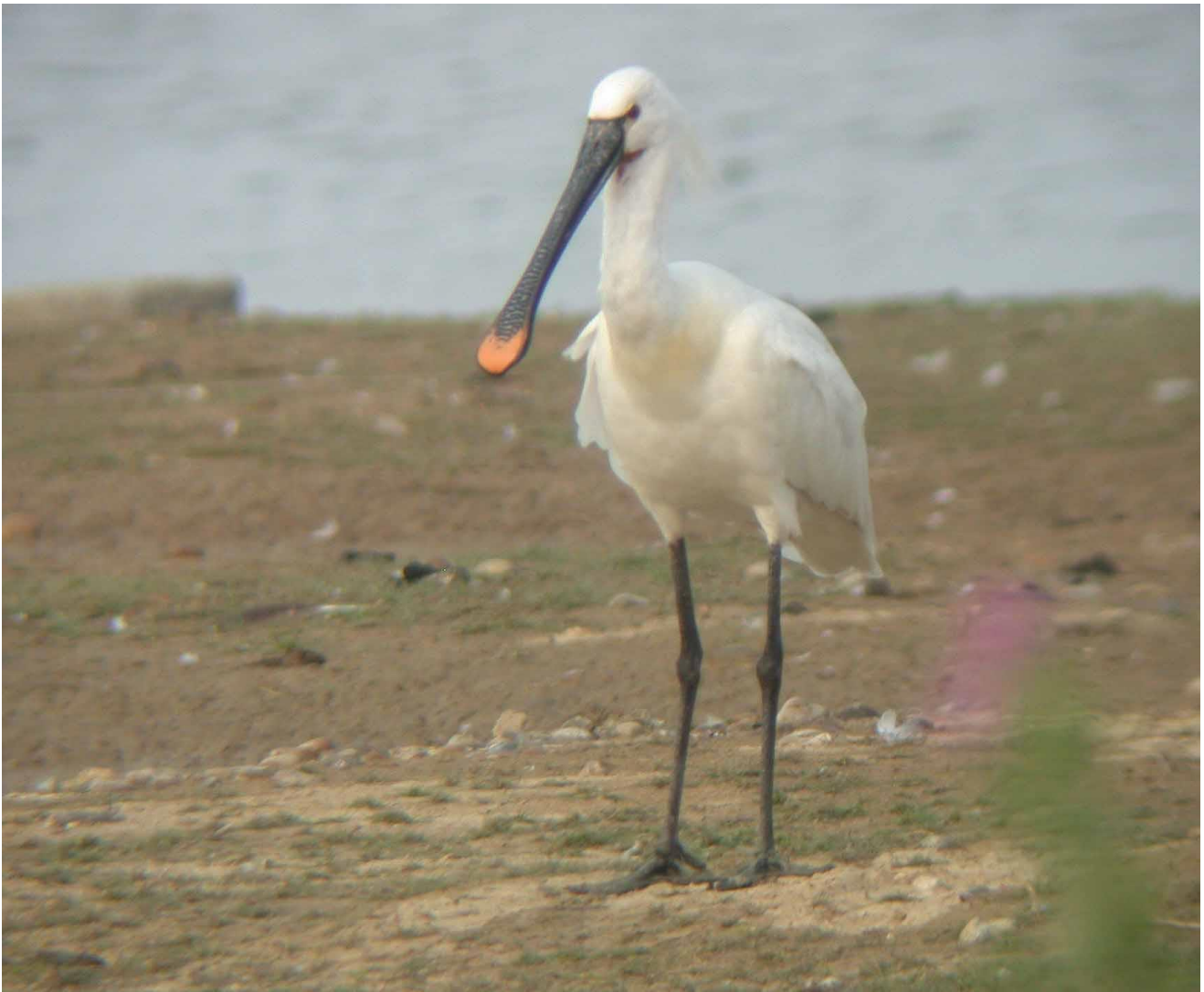
Spoonbill at Nickoll's Quarry

2017 Seabrook, one flew east, 23 rd April