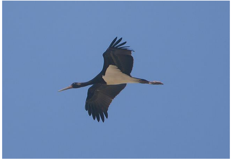
Black Stork at Dungeness (Martin Casemore), the same bird earlier seen at Hythe

A rare vagrant to Kent with 25 appearances to the end of 2014. Records are well spread between the 28 th April and 10 th October, with sightings in all the months in between, though with a peak in May (6) and June (5). There is a wide spread also to the locations involved.