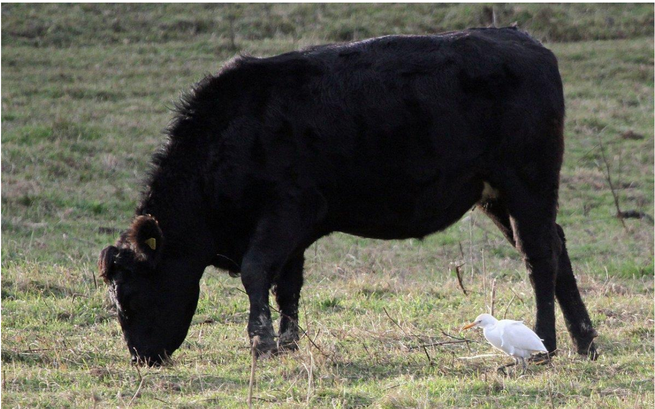
Cattle Egret at Round Down (Paul Holt)

Bare parts: short, yellow beak and legs greenish-brown.