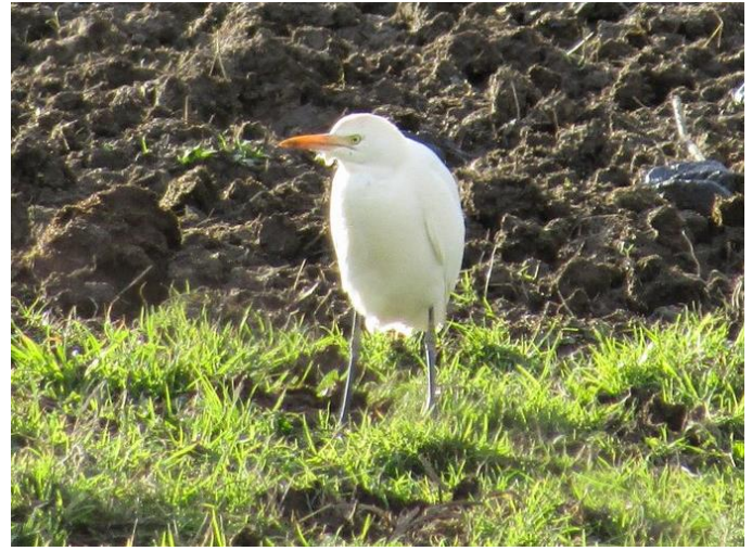
Cattle Egret at Round Down (Paul Holt)

Cattle Egret has an almost cosmopolitan distribution in the tropics, being present in five continents. It has recently increased its range quite dramatically on a global scale, with noticeable increases in both numbers and range within Europe, although its stronghold remains in the Mediterranean basin. It first bred in Britain in 2008 in Somerset in 2008, with a single pair again present in this county in 2010 but there have not yet been any further signs of colonisation. The European population is partially migratory, and winters mainly in Iberia and North Africa.