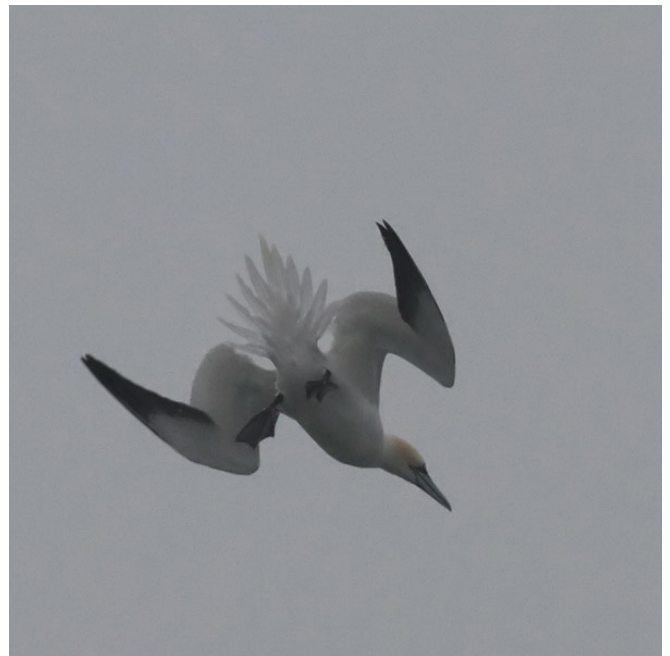
Gannet at Hythe (Brian Harper)

The full species account will follow but the breeding and wintering distribution maps based on the 2007 – 2012 BTO / KOS atlas are provided below.