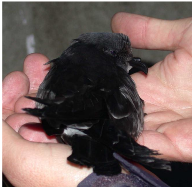
Leach's Petrel at Samphire Hoe