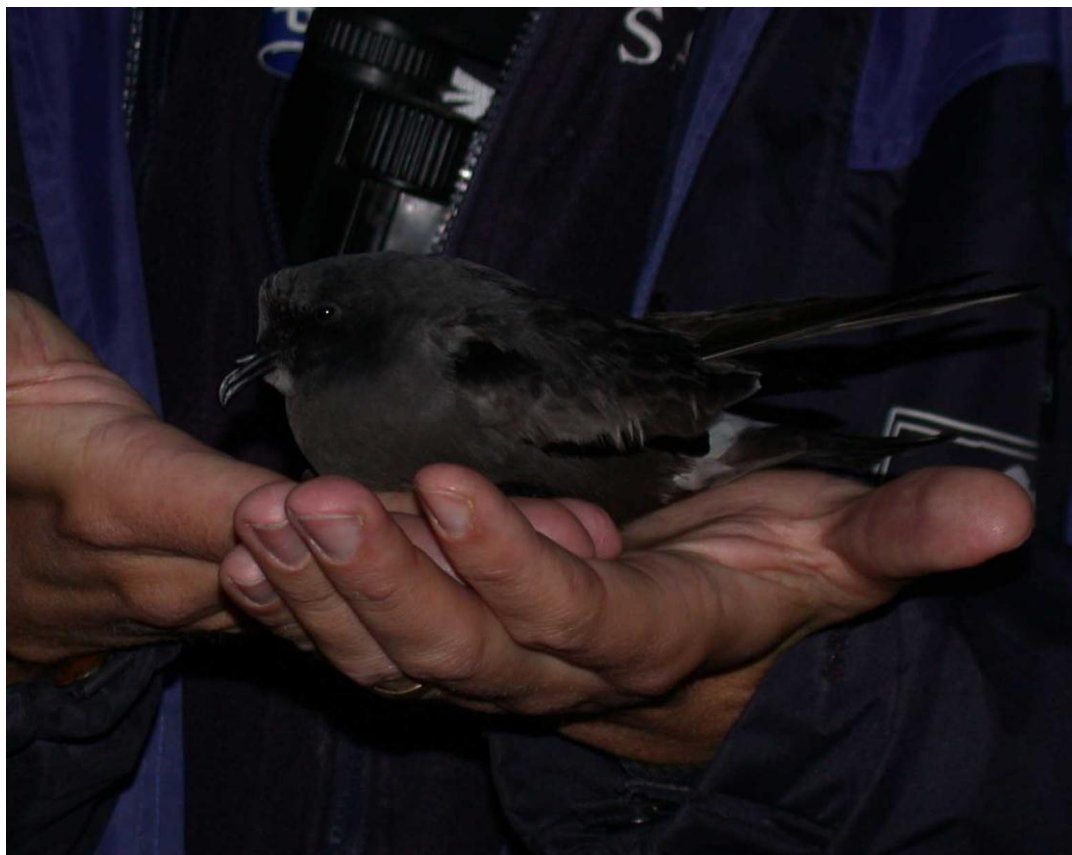
Leach's Petrel at Samphire Hoe