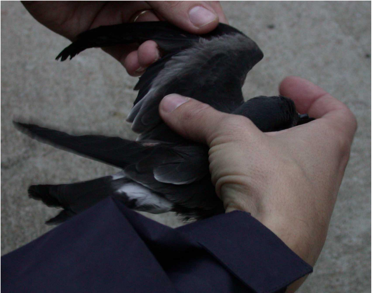
Leach's Petrel at Samphire Hoe

In addition, there is a record of two distant unidentified petrels, either this species or Storm Petrel (though probably Leach's Petrel), which flew west past Copt Point on the 19 th September 2000.