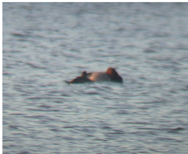
Ruddy Duck at Nickoll’s Quarry (Ian Roberts)

Following a considerable increase and breeding in the county, a nationwide eradication programme aimed at preventing interbreeding with White-headed Duck in southern Europe was implemented. The latest report from this programme concludes that fewer than 100 remain in the UK and confirms that the cull has been extended to complete the task, so future records are now extremely unlikely.