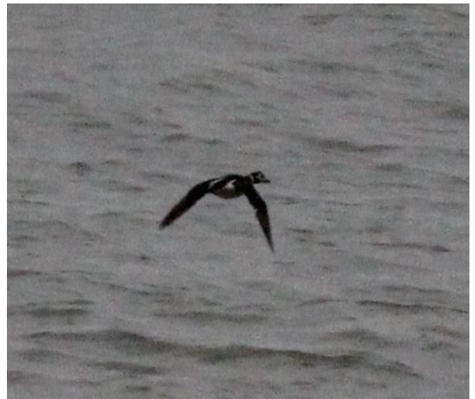
Long-tailed Duck at Samphire Hoe

An uncommon but regular passage migrant and winter visitor in Kent.