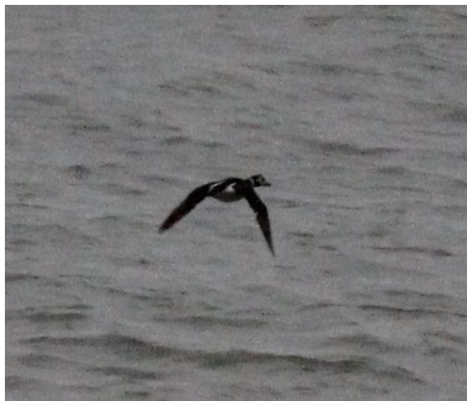
Long-tailed Duck at Samphire Hoe

An uncommon but regular passage migrant and winter visitor in Kent.