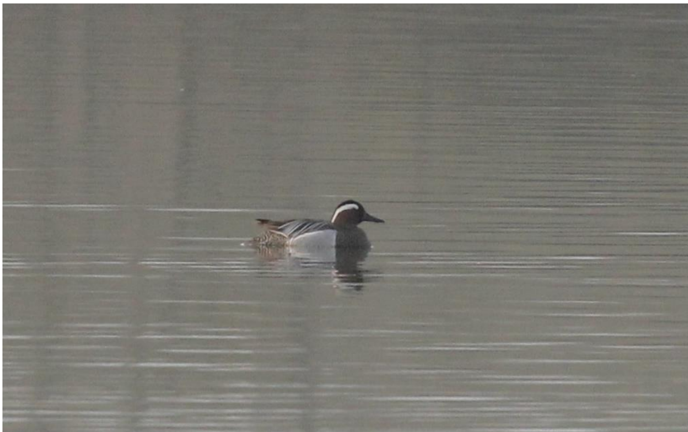
Garganey at Nickolls Quarry