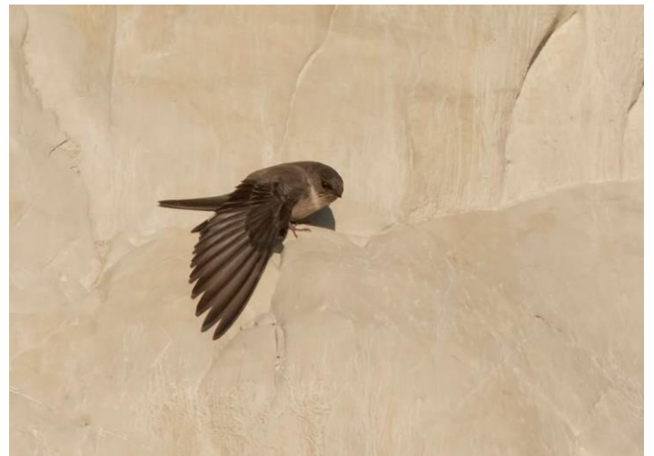
Crag Martin at Samphire Hoe