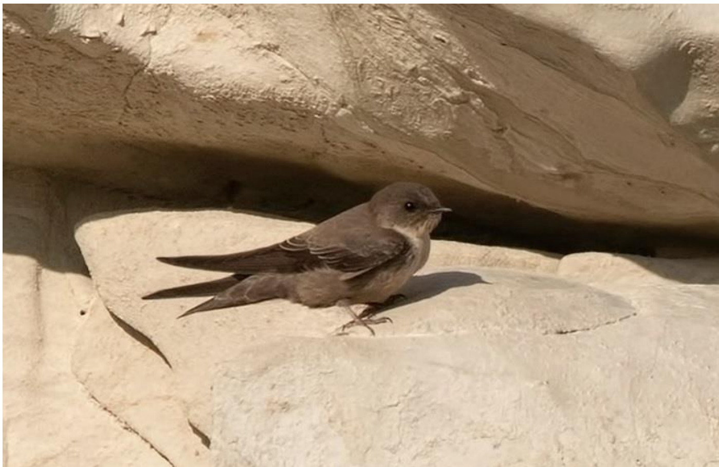
Crag Martin at Samphire Hoe