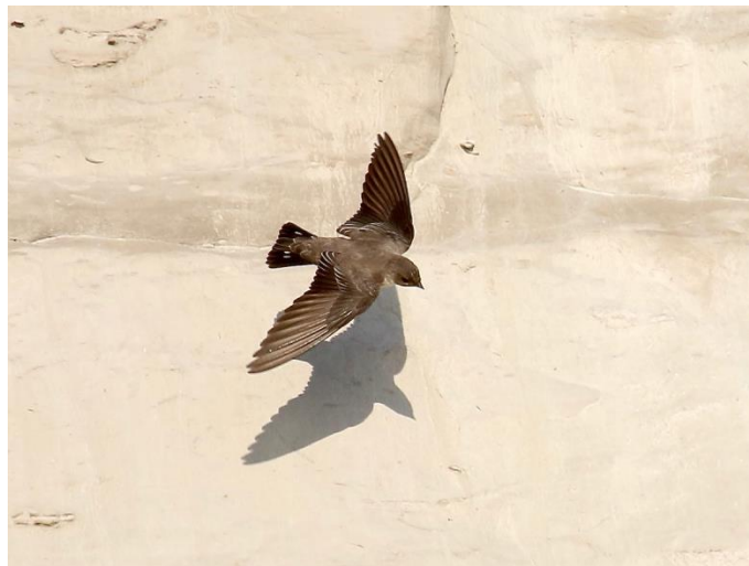
Crag Martin at Samphire Hoe