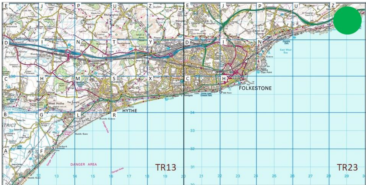
Figure 3: Distribution of all Crag Martin records at Folkestone and Hythe by tetrad