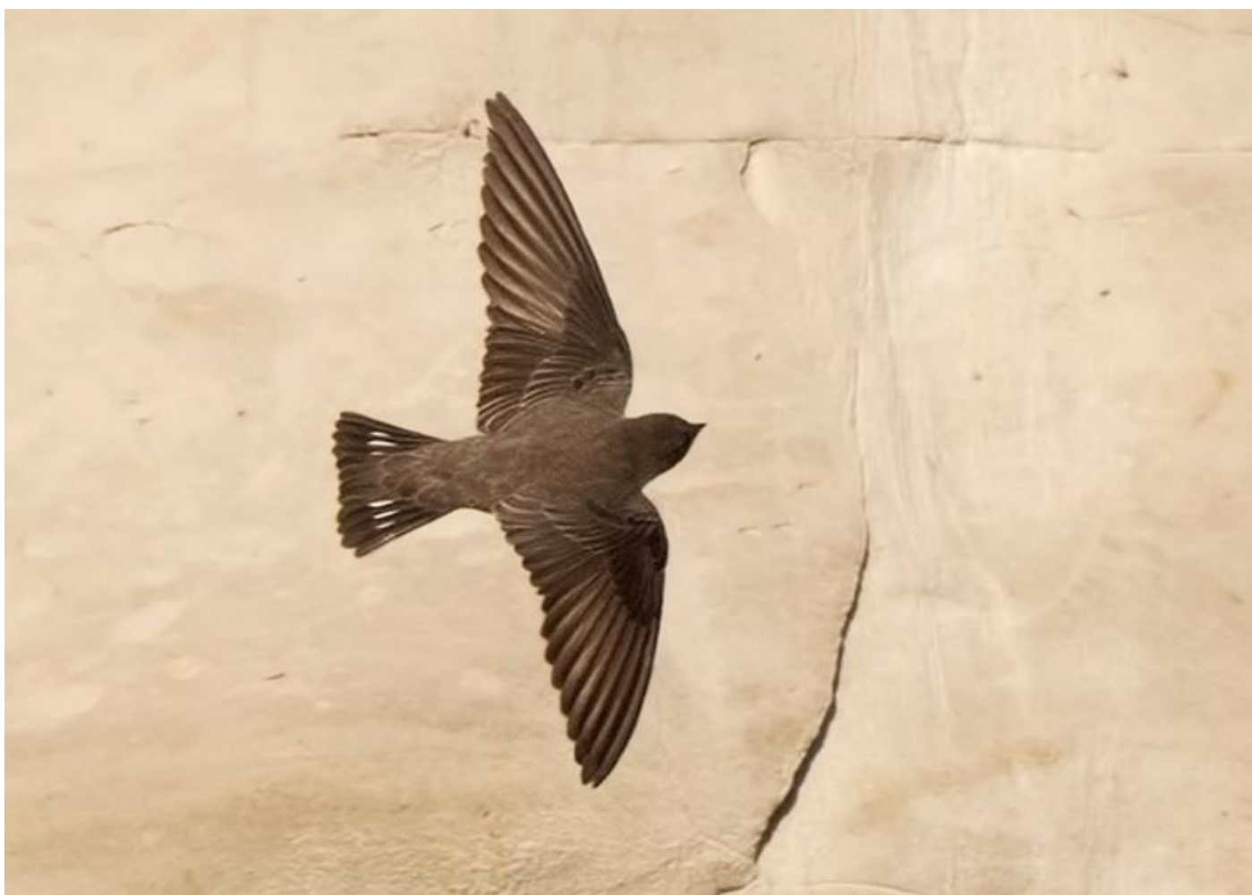
Crag Martin at Samphire Hoe