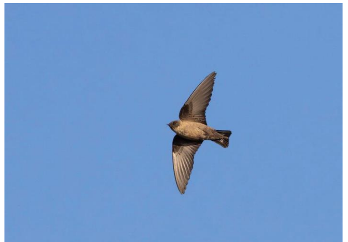
Crag Martin at Samphire Hoe