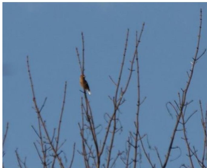
Hawfinch at Burmarsh