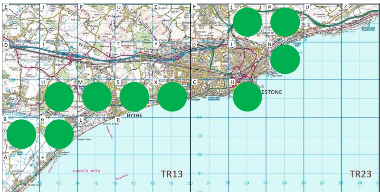
Figure 3: Distribution of all Hawfinch records at Folkestone and Hythe by tetrad

Records are well distributed by month with records in all except July and August. There have been five records from Capel-le-Ferne (between 1993 and 2006), with others at nearby Creteway Down (in October 2017) and Copt Point (in September 2020), and three at Nickolls Quarry (two in late 2002 and one in October 2019). One was seen flying east along the top of Hythe Roughs in January 2011, there were three records during a national irruption in 2018, with one at a garden feeder in Saltwood on the 12 th March, two in a garden in central Folkestone on the 17 th March and a pair at Horn Street on the 18 th October, and one was seen in Burmarsh Churchyard on the 3 rd March 2020.