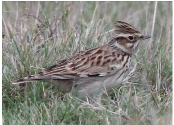
Wood Lark at Samphire Hoe (Ian Roberts)

Woodward et al (2020) provide an estimate of around 2,300 breeding pairs in Britain, with the largest numbers on the lowland heathlands in Hampshire, Sussex, Surrey, Suffolk and Norfolk (Holling et al , 2019).