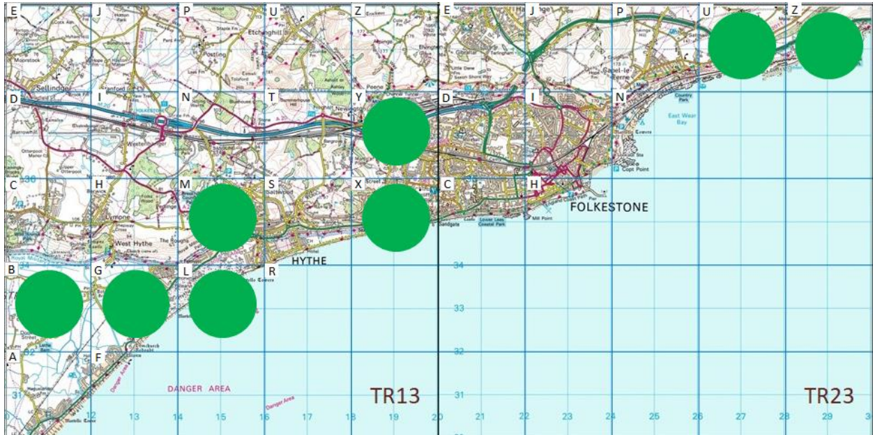
Figure 3: Distribution of all Wood Lark records at Folkestone and Hythe by tetrad

Figure 3 shows the distribution of records by tetrad: