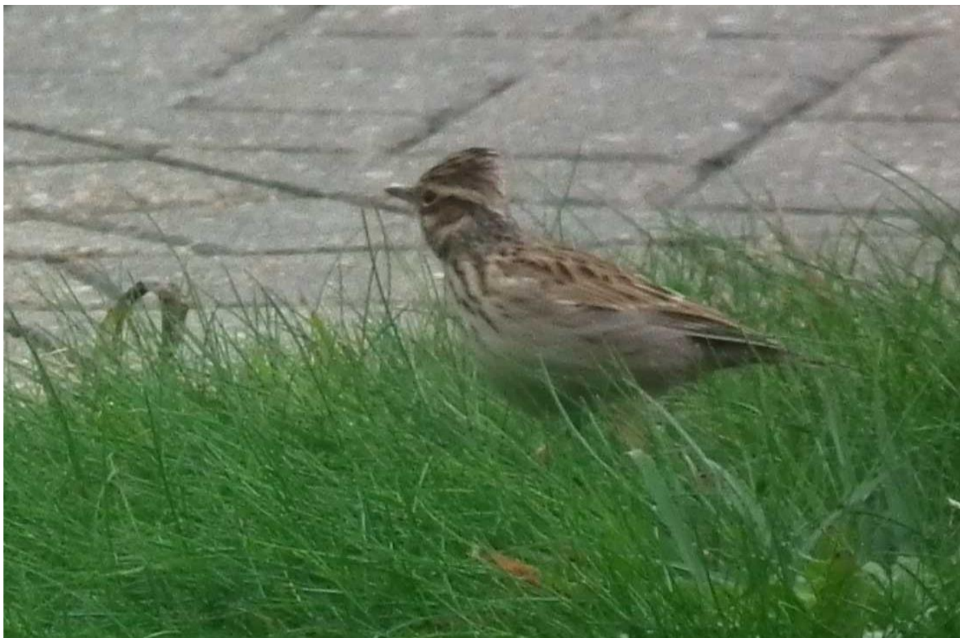
Wood Lark at Samphire Hoe (Paul Holt)