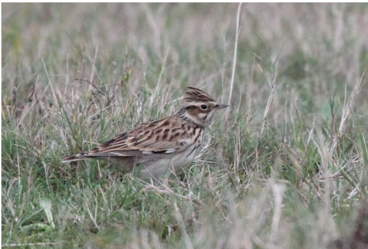
Wood Lark at Samphire Hoe