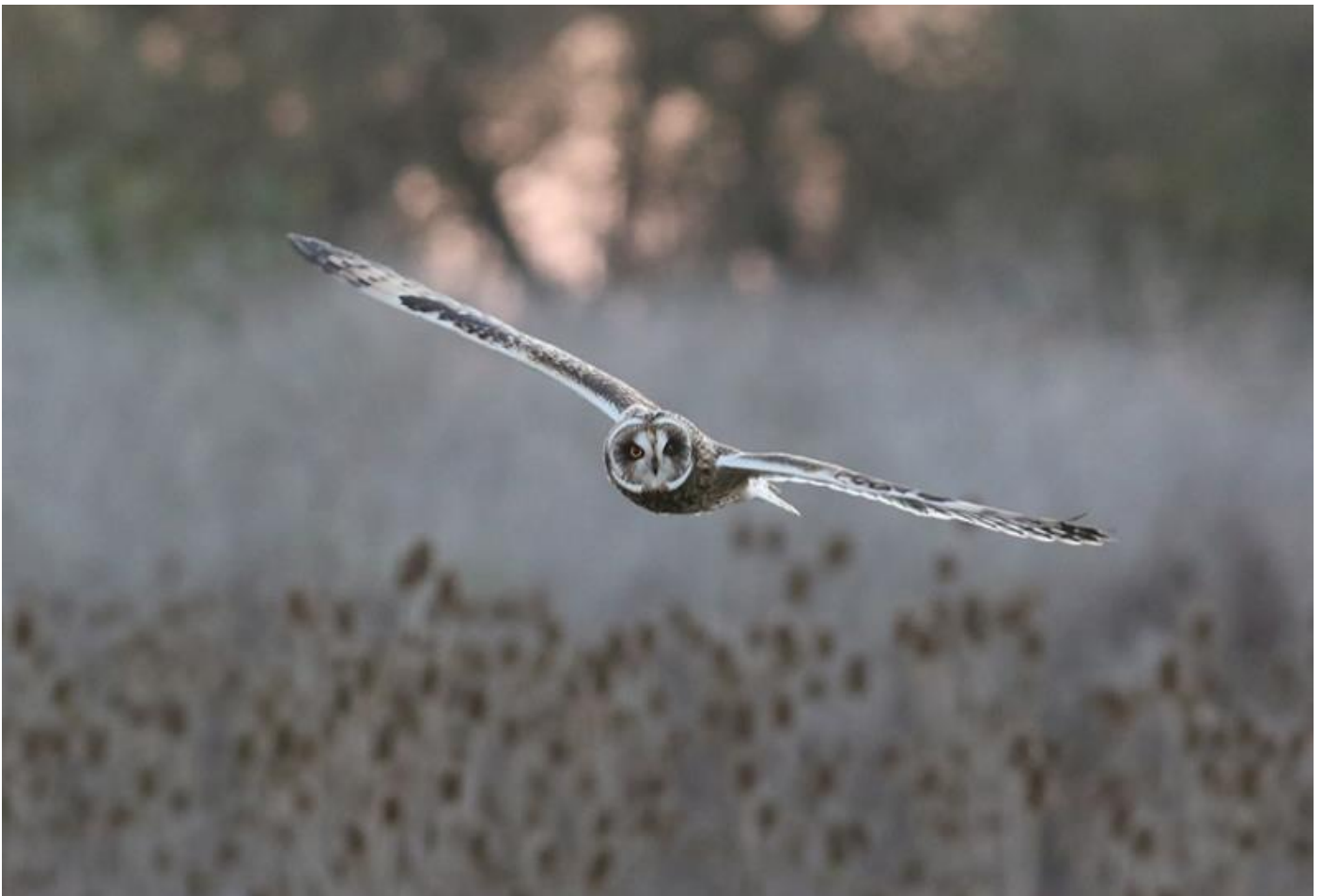
Short-eared Owl at Botolph's Bridge (Brian Harper)

The tetrad map images were produced from the Ordnance Survey Get-a-map service and are reproduced with kind permission of Ordnance Survey .