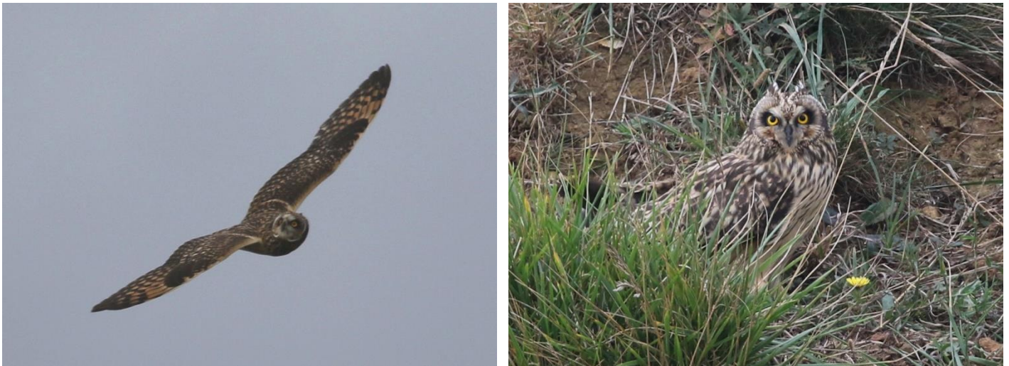
Short-eared Owl at Abbotscliffe (Ian Roberts)

There are occasional winter records but none have lingered for more than a day. The chart shows a smaller peak between late March and May, reflecting an irregular spring passage, with a peak of five records in 2012. Summer sightings are rare. One seen near Rock Cottage on the Botolph's Bridge Road was probably a late migrant but the record from 1956 did perhaps suggest local breeding, particularly as numbers in the county were approaching their peak level at this time. There is also an unusual, isolated record of two at Abbotscliffe on the 21 st July 1988.