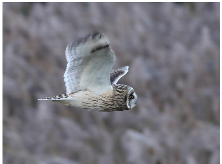
Short-eared Owl at Botolph's Bridge (Brian Harper)