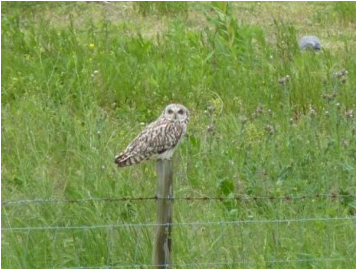
Short-eared Owl at Botolph's Bridge