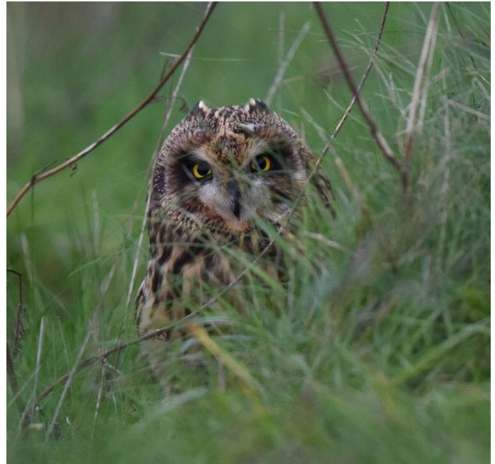
Short-eared Owl at Princes Parade (Nigel Webster)

The British population is thought to be somewhere between 600 and 2,150 breeding pairs, mainly on open moorland (Woodward et al , 2020), or in Kent on flat grazing marsh (Clements et al , 2015).