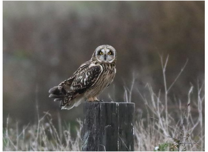
Short-eared Owl at Botolph's Bridge (Brian Harper)