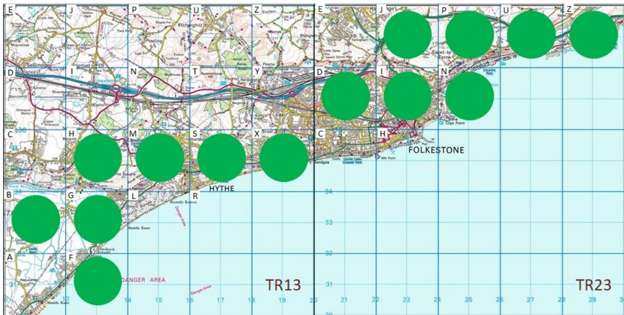
Figure 3: Distribution of all Short-eared Owl records at Folkestone and Hythe by tetrad

Figure 3 shows the distribution of all records of Short-eared Owl by tetrad, with records in 14 tetrads (45%).