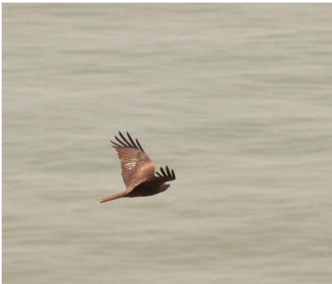
Black Kite at Capel-le-Ferne (Dale Gibson)

The tetrad map images were produced from the Ordnance Survey Get-a-map service and are reproduced with kind permission of Ordnance Survey .