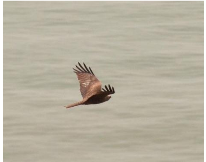
Black Kite at Capel-le-Ferne (Dale Gibson)

It was formerly a very rare vagrant in Britain, with just five records prior to the period covered by the British Birds Rarities Committee began (1950), a further four in the next twenty years. It started to be recorded annually in Britain from 1974, in gradually increasing numbers and ceased to be considered a national rarity after 2005, when 365 had been logged (BBRC, 2020).