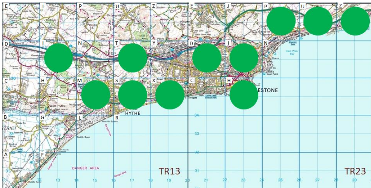
Figure 3: Distribution of all Black Kite records at Folkestone and Hythe by tetrad

Records have been fairly well distributed with records in 11 (35%) of tetrads. Five have been seen over Cheriton/Folkestone, with four records (involving six birds) at the cliffs between Capel-le-Ferne and Samphire Hoe, three at Hythe and singles at Westenhanger, Saltwood and Beachborough Park.