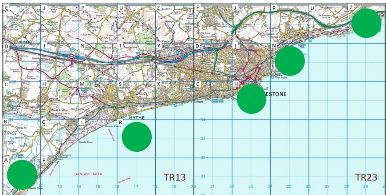
Figure 3: Distribution of all Sooty Shearwater records at Folkestone and Hythe by tetrad

The vast majority of records are from the Copt Point/Folkestone Pier/Mill Point area (37), with four at Samphire Hoe and Hythe, and one at the Willop Basin. The first area record is only given as "Folkestone".