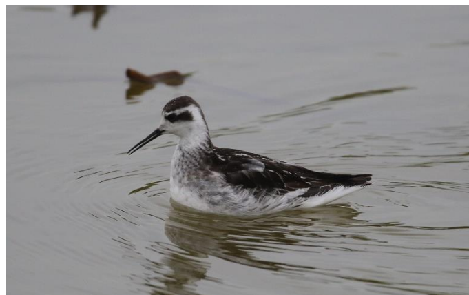
Red-necked Phalarope at Donkey Street (Ian Roberts)

Breeds in Iceland, northern Fenno-Scandia and Russia, eastwards across northern Siberia to Alaska, northern Canada and Greenland. Migrates mainly overland but winters pelagically off western South America, in the Arabian Sea and among the East Indies (Snow & Perrins, 1998). A rare breeding species in Britain, mainly in Shetland and the Outer Hebrides, where there has been a recent increase to around 80 'pairs' (Holling et al , 2019).