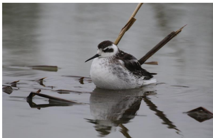
Red-necked Phalarope at Donkey Street (Ian Roberts)