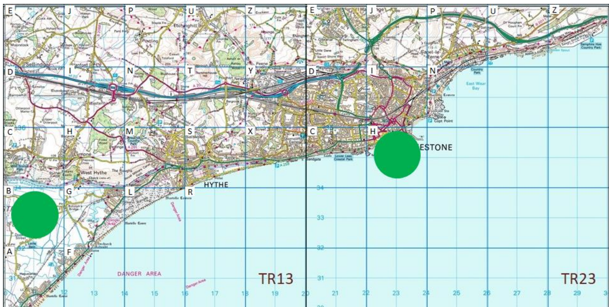
Figure 3: Distribution of all Red-necked Phalarope records at Folkestone and Hythe by tetrad

Figure 3 shows the distribution of records by tetrad.