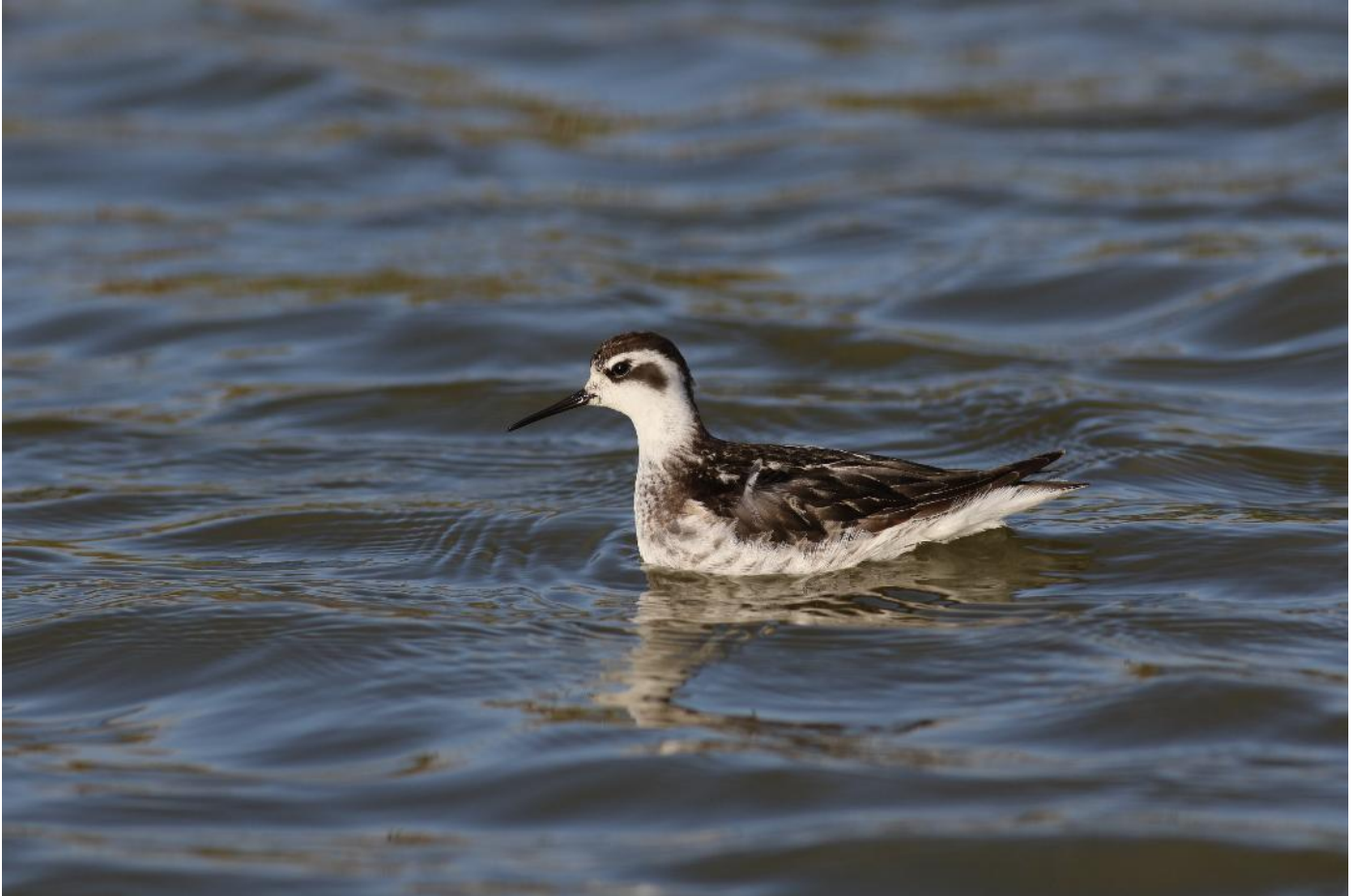
Red-necked Phalarope at Donkey Street

The tetrad map images were produced from the Ordnance Survey Get-a-map service and are reproduced with kind permission of Ordnance Survey .