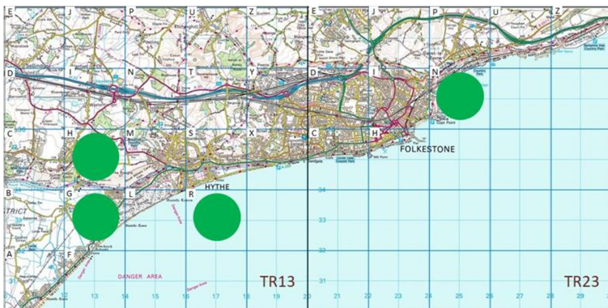
Figure 3: Distribution of all Smew records at Folkestone and Hythe by tetrad

Apart from a migrant which passed Copt Point on the 3 rd November, all have been recorded between the 24 th November (week 47) and 26 th February (week 9), with a peak arrival time of late January/early February, as shown in figure 2. The vast majority of records were associated with severe weather.