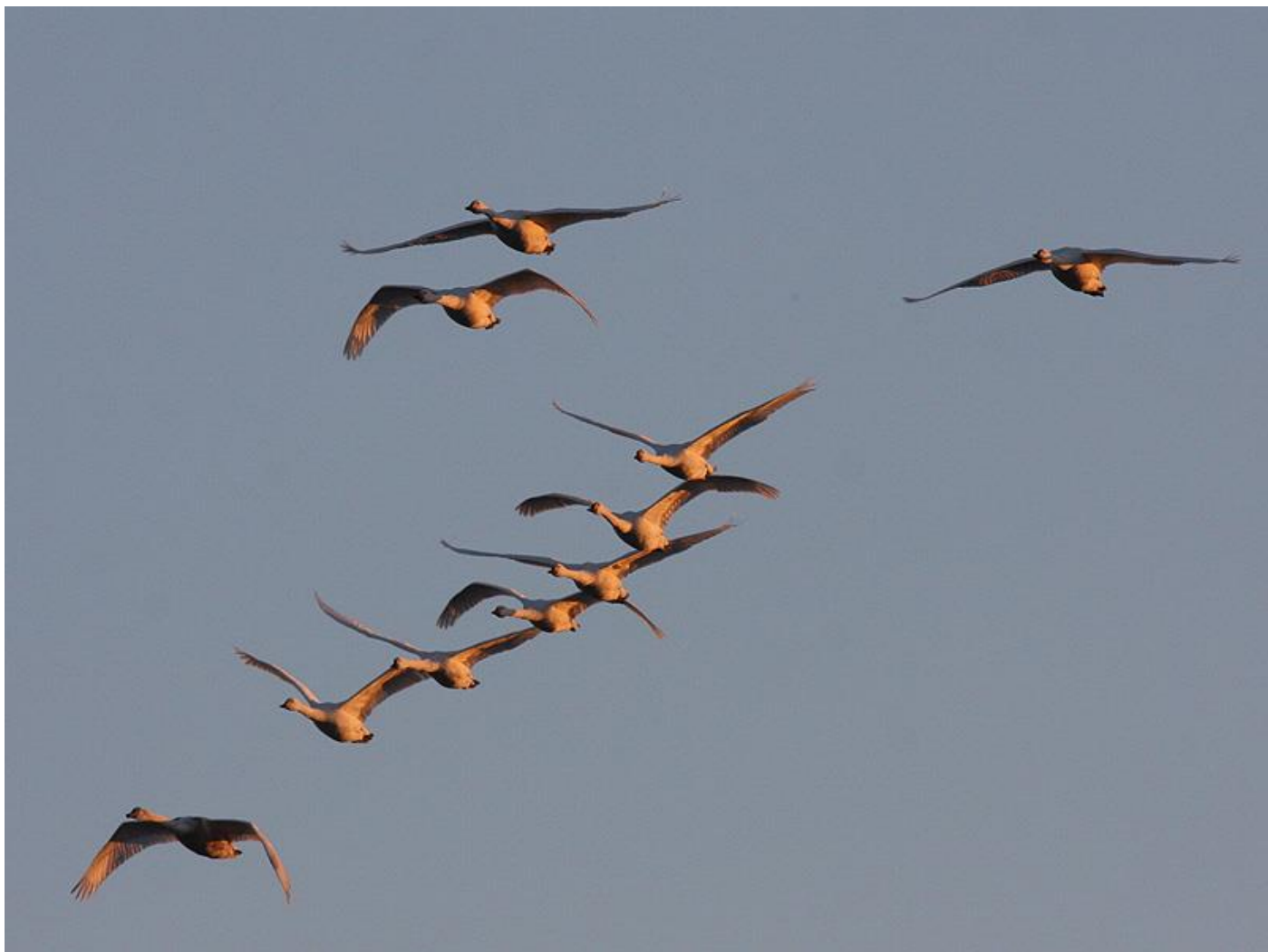
Bewick's Swans at Botolph's Bridge