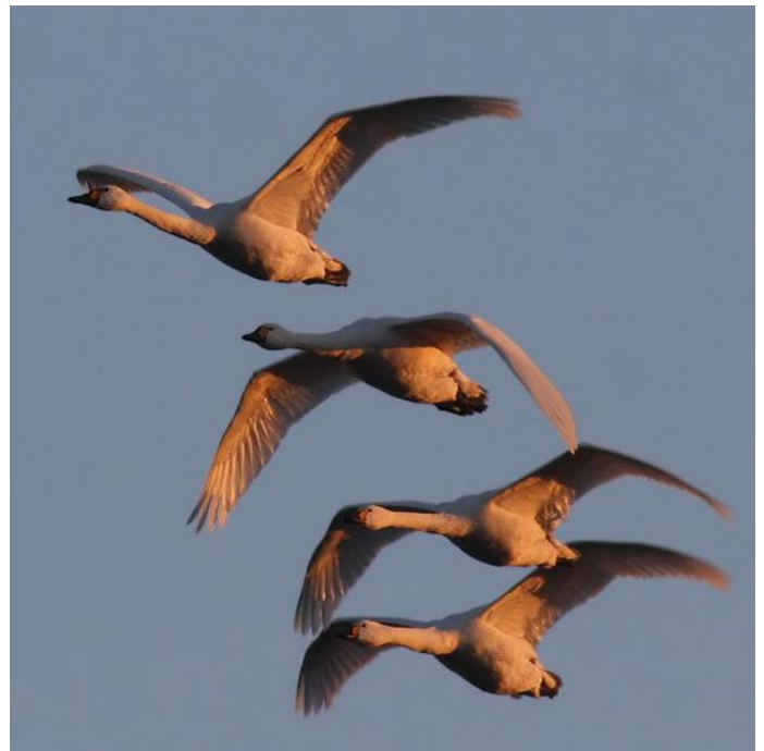
Bewick's Swans at Botolph's Bridge