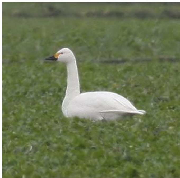
Bewick's Swan at Botolph's Bridge