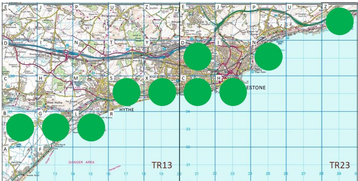
Figure 3: Distribution of all Bewick's Swan records at Folkestone and Hythe by tetrad

Figure 3 shows the distribution of all records of Bewick's Swan by tetrad.