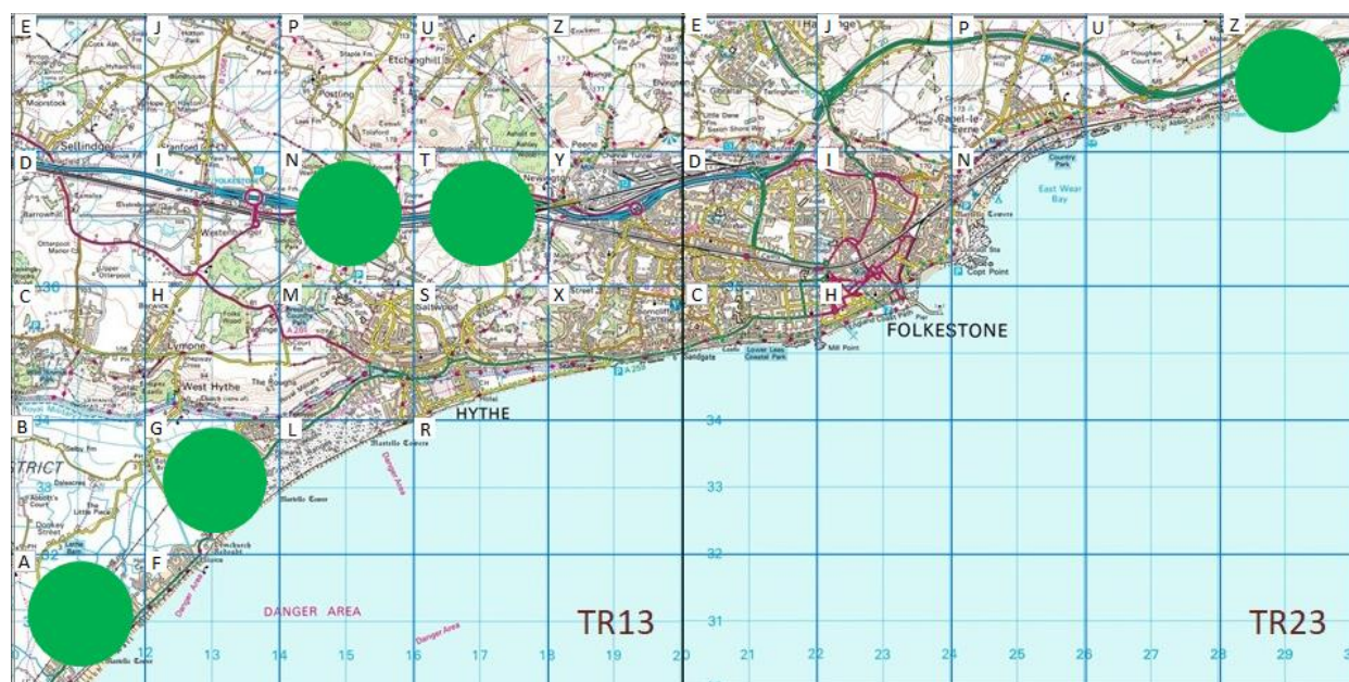
Figure 3: Distribution of all Quail records at Folkestone and Hythe by tetrad

The dated records are well spread, as demonstrated by figure 2, with records from every month between April and October, and two in June, August and October. The modern records are considered to relate to migrants though one calling at Beachborough Lakes on the 21 st June 2018 could have involved a local breeder.