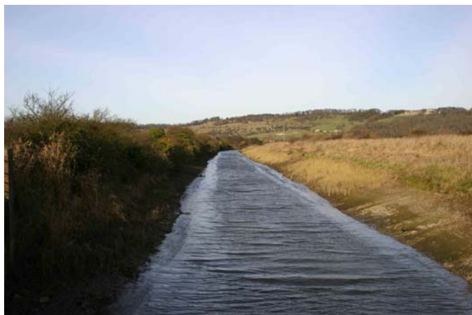
Looking north along the Canal Cutting from the road bridge towards the pub

Disabled access is probably restricted to viewing from the road, due to stiles etc., but many of the area's birds tend to be viewable in this way. Access by public transport would involve using the main bus route between Hythe and Dymchurch, and there is a bus stop just beyond the sluice where the canal cutting reaches the sea.