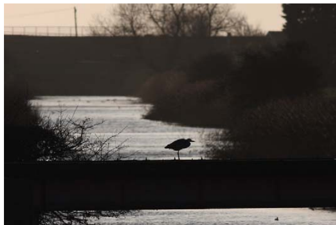
Looking south along from the road bridge towards the sea, with Grey Heron