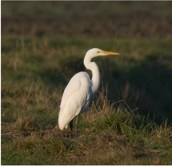
Great White Egret (Brian Harper)