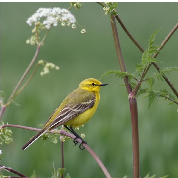
Yellow Wagtail (Brian Harper)