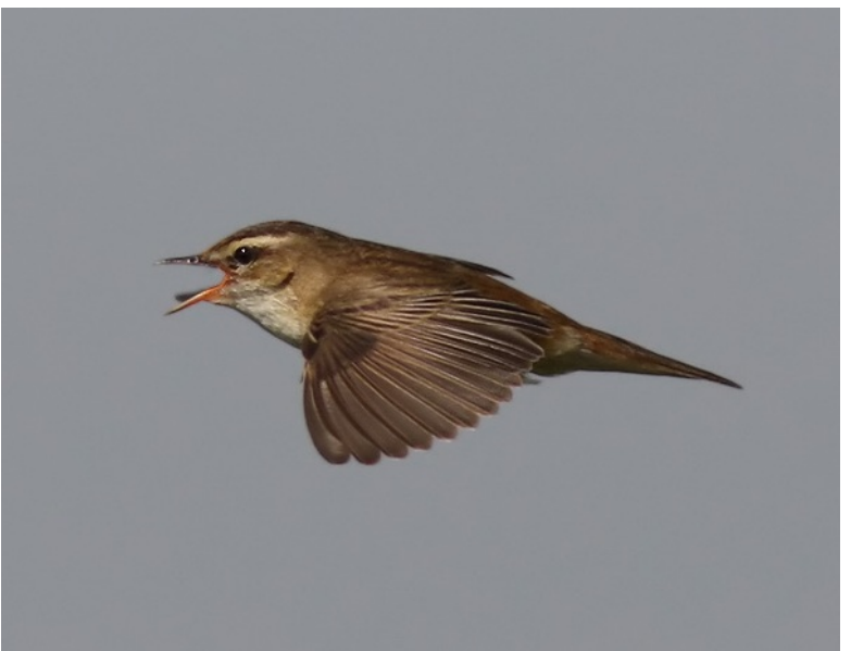
Sedge Warbler (Brian Harper)