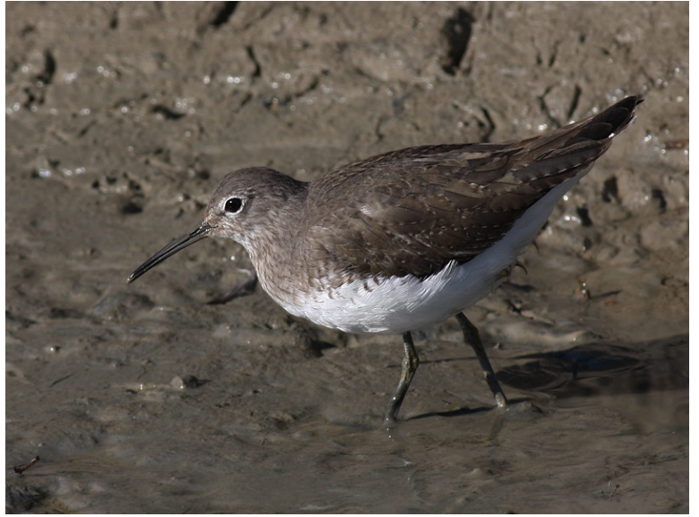
Green Sandpiper (Brian Harper)