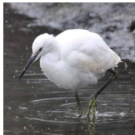
Little Egret (Brian Harper)