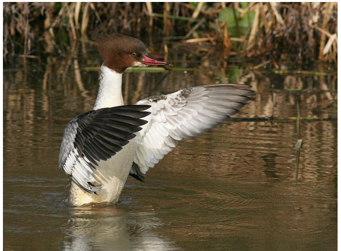
Goosander at Seabrook