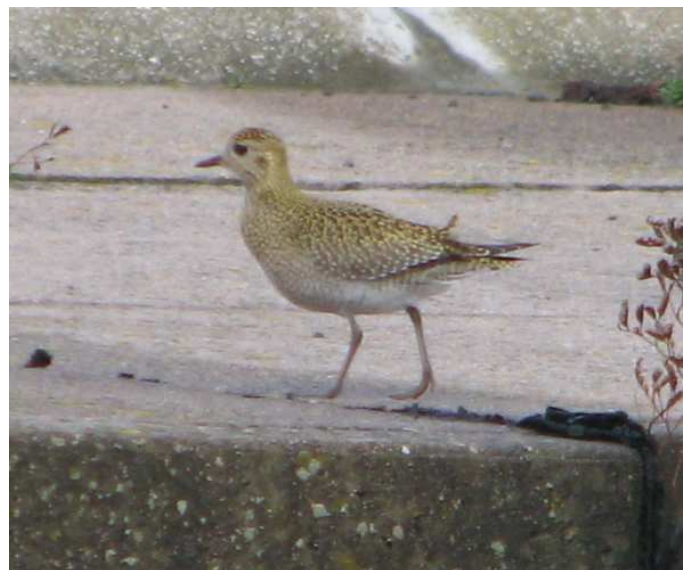
Golden Plover at Samphire Hoe