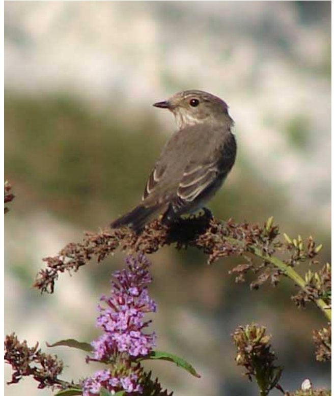
Spotted Flycatcher at Samphire Hoe (Paul Holt)

A Manx and 3 Sooty Shearwaters, and 3 Arctic Skuas flew west past Copt Point on the 24 th , and reasonable numbers of Gannets (peak 100 off Mill Point on the 24 th ), Sandwich Terns (peak 200 on Folkestone Beach on the 21 st ), and Razorbills (peak 7 past Folkestone on the 24 th ) were also seen during this period. It was quiet on the land, although a Sedge Warbler, a Whitethroat, 2 Wheatears, 6 Chiffchaffs, and c.15 Blackcaps were at Samphire Hoe on the 23 rd , and small numbers of Meadow Pipits and hirundines moved west.