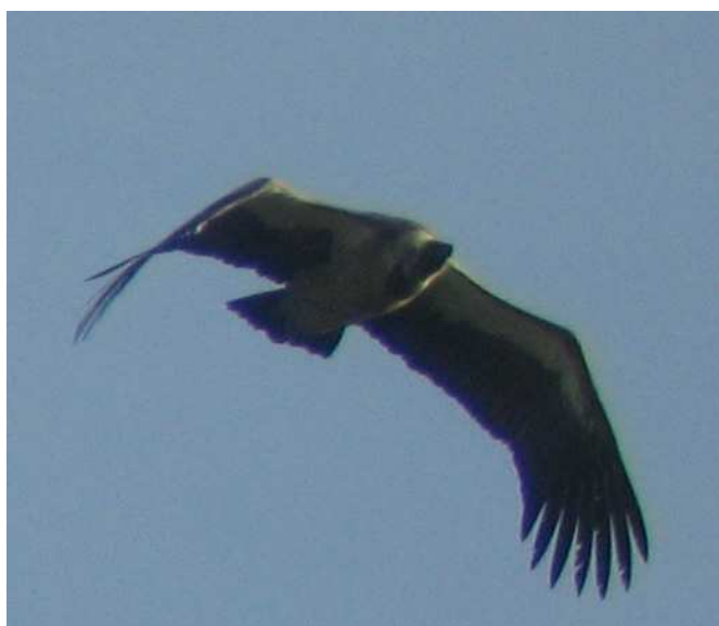
above and below: escaped White-backed Vulture - Sandling (Chris Philpott)