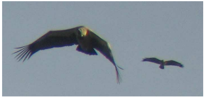
escaped White-backed Vulture with Common Buzzard - Sandling

A total of 98 species were recorded in January, including a single day peak of 85 on the 14 th .