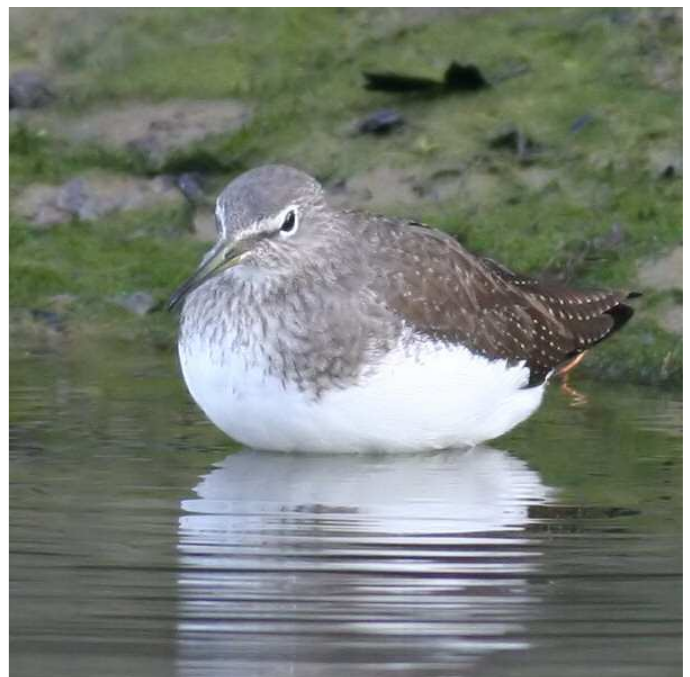
Green Sandpiper at Botolph's Bridge (Brian Harper)

13th - House Martin 10th - Arctic Skua 6th - Blackcap 5th - Swallow