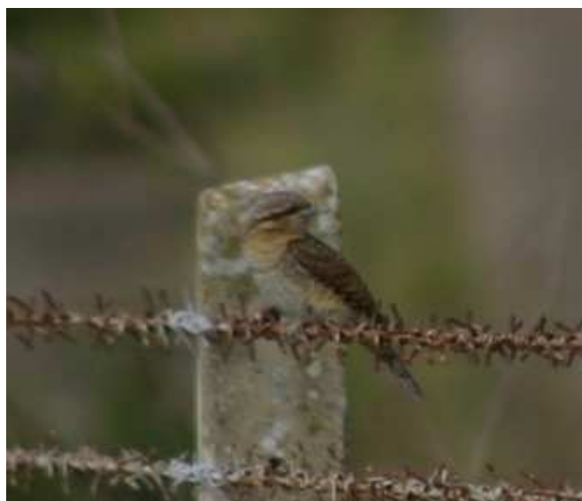
Wryneck at Samphire Hoe, and below with Pied Flycatcher (Ian Roberts)

The 26 th produced a Wryneck and a Honey Buzzard at Samphire Hoe, with a supporting cast of Pied Flycatcher, Redstart, and Garden Warbler there. More common migrants comprised a Lesser Whitethroat, 3 Wheatears, 6 Willow Warblers, 7 Whitethroats, and 12 Whinchats in the Samphire Hoe - Abbotscliffe area. 17 Sand Martins, 23 Yellow Wagtails, and 250 Swallows flew west at Abbotscliffe and single Lapwing and Common Sandpiper were