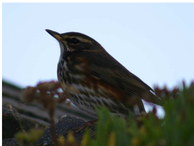
Redwing at Samphire Hoe (Ian Roberts)

The next three days were mild and wet and there was little of note, but drier, fresher conditions followed and there was a reasonable visual immigration into a cool northerly headwind. The 18 th produced good numbers of thrushes, with a Ring Ouzel, 6 Song Thrushes, 35 Fieldfares, and 450 Redwings, and finches included 2 Bramblings, 10 Siskins, 15 Lesser Redpolls, and 150 Goldfinches. A Snipe, 2 Grey Wagtails, and 18 Tree Sparrows were also logged. There were very few thrushes on the 19 th , but finches were again in evidence, with 7 Lesser Redpolls, 10 Bramblings, 16 Siskins, 22 Greenfinches, 54 Chaffinches, and 100 Goldfinches. A Yellowhammer, 2 Sand Martins, and 3 Stock Doves were also noteworthy.