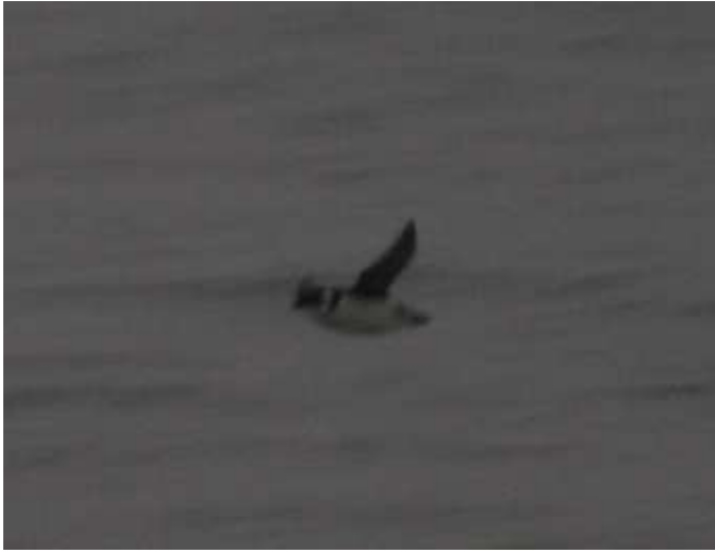
Little Auk at Hythe