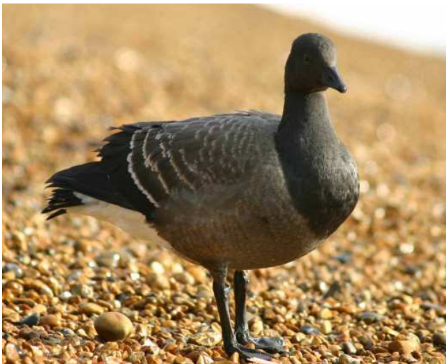
Brent Goose at Folkestone (Ian Roberts)

Four late House Martins were at Samphire Hoe on the 12 th -13 th , with 2 Redwings and a Chiffchaff there on the latter date. There was a significant movement of Redwings on the night of the 14 th /15 th , and 40 Siskins flew east at Samphire Hoe on the 15 th , whilst 5 Wigeon, 10 Brent Geese, 11 Shelducks, and 20 Common Scoter flew east there, with a further 18 of the latter species off Hythe the next day.