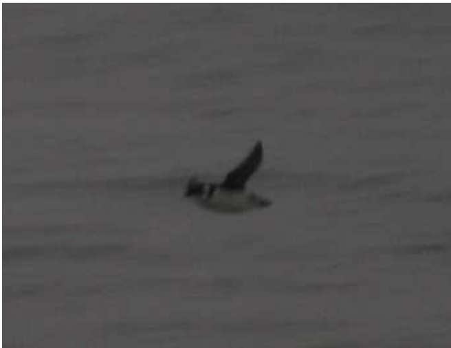
Little Auk at Hythe