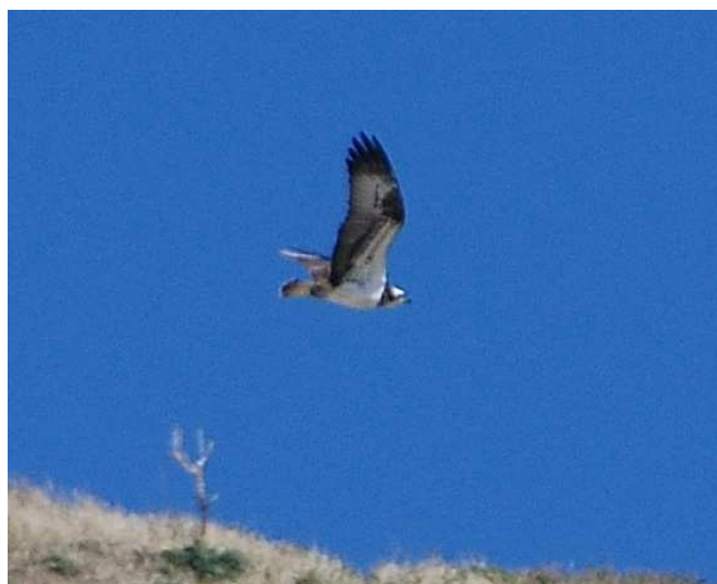
Osprey at Samphire Hoe (Nigel Jennings)

13th - Hobby 9th - Spotted Flycatcher 2nd - Black Tern - Osprey 1st - Arctic Tern