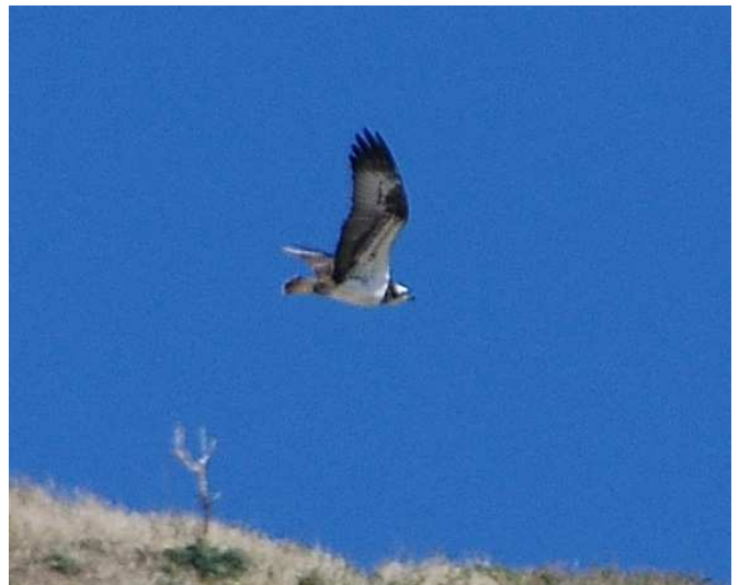
Osprey at Samphire Hoe (Nigel Jennings)

13th - Hobby 9th - Spotted Flycatcher 2nd - Black Tern - Osprey 1st - Arctic Tern