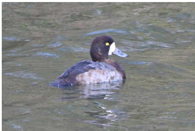
Scaup on the Hythe Canal

Wintering Water Rails were at Nickoll's Quarry (at least 2), Hythe Canal, and Horn Street and there was a peak of just 11 Coot at the former site. Lapwing numbers were very low, with a peak of just 80 at Westenhanger, and no