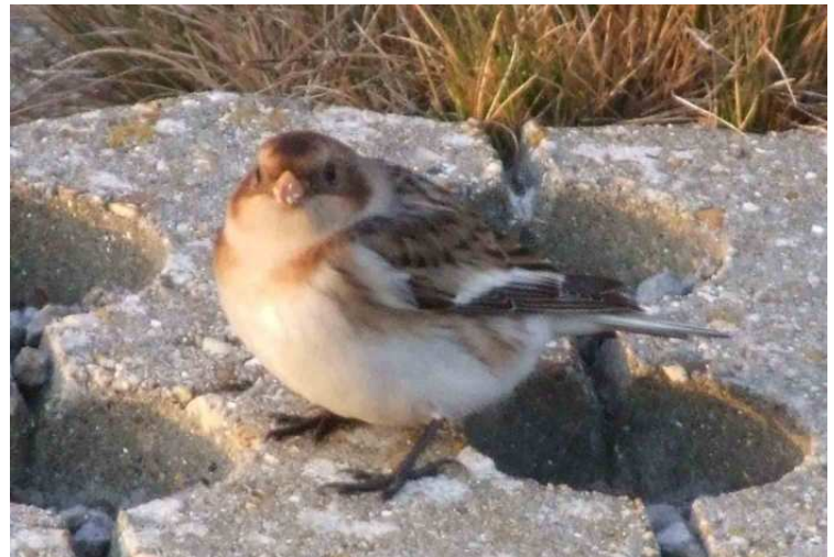
Snow Bunting at Samphire Hoe

Wildfowl were also involved in the movement and included totals of 53 Brent Geese, 32 Common Scoters, 17 Shelducks, and a Red-breasted Merganser, and a small number of Red-throated Divers, Great Crested Grebes, Gannets, Kittiwakes, and large auks were also logged. A Short-eared Owl flew in off the sea at Samphire Hoe on the 11 th , on which date a Snow Bunting was on the seawall there, and 3 Purple Sandpipers flew west past Folkestone Beach.