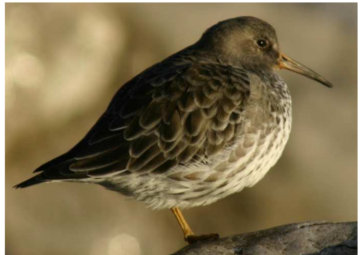
Purple Sandpiper at Hythe (Ian Roberts)

Low pressure returned from the 18 th and there was rain and showers, often heavy and thundery, and temperatures dropped from the 23 rd as wind turned more northerly again, whilst the last few days of the month were milder, but more unsettled. This meant that the latter half of the month was rather quiet. Up to 5 Purple Sandpipers were wintering at Hythe, and other waders included a peak of 36 Ringed Plovers on Folkestone Beach, up to 29 Turnstones at Hythe, 6 Redshank at Folkestone Harbour, and a few Snipe at Nickoll's Quarry.