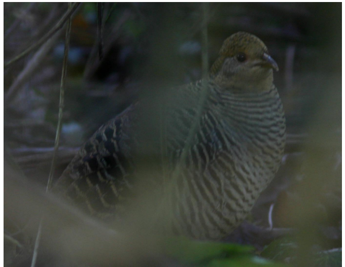
presumed escape female Golden Pheasant - Horn Street Lake (Ian Roberts)