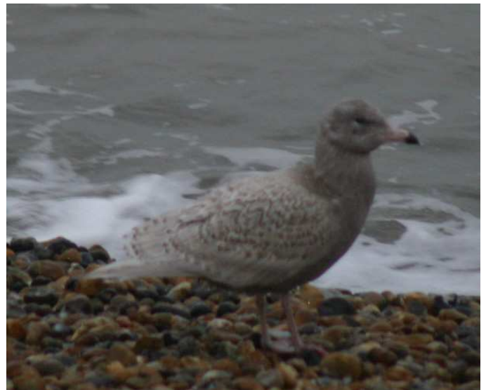
First-winter Glaucous Gulls at Hythe (Ian Roberts)