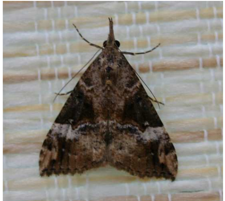
Bloxworth Snout - Hythe - 1 st November

After the large numbers of Clancy's Rustics in autumn 2006 it was perhaps not surprising that the first spring record occurred in 2007 – at Hythe on 13 th June (photo). There were a further 2 in early October perhaps suggesting fresh immigration.