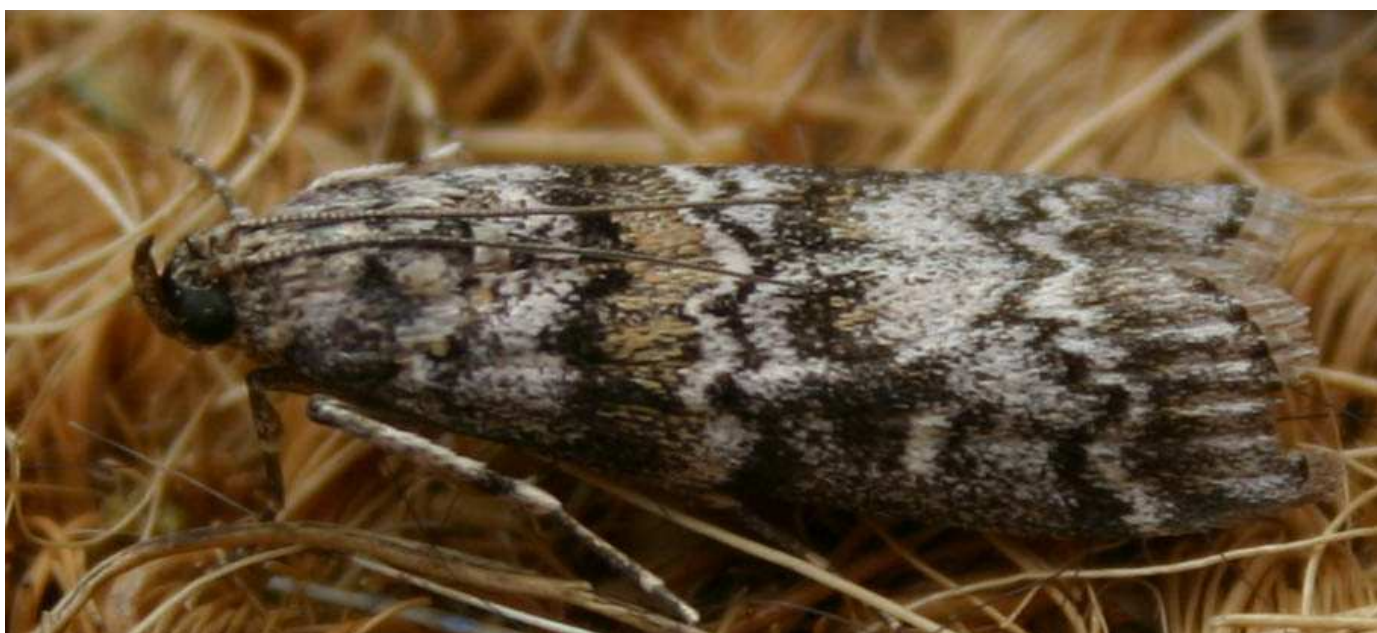
abietella - Hythe - 13 th June

A rather large abietella (length 19mm) trapped well away from the vicinity of pine, at Hythe on the 13 th June (photo), was presumably a migrant.