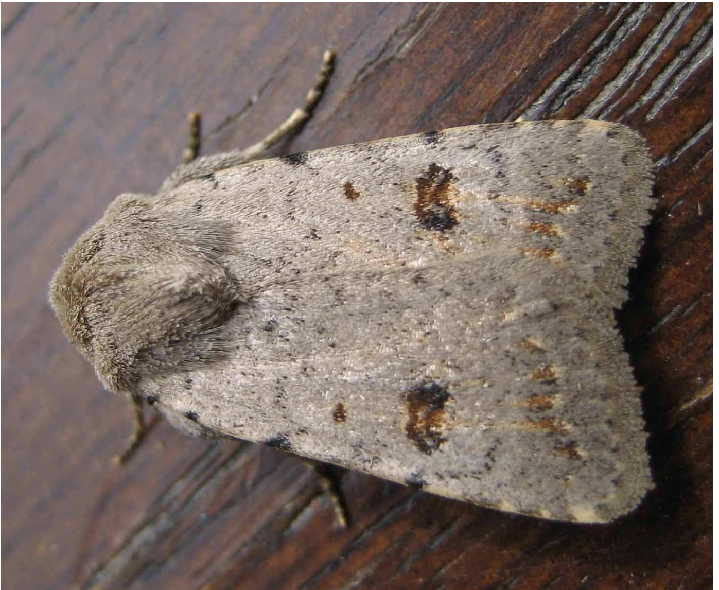
Clancy's Rustic - Hythe - 13 th June

Only two Hummingbird Hawk-moths were reported and these were in the earlier part of the year – at Folkestone on the notably early date of 24 th February, and at Hythe on the 14 th April.