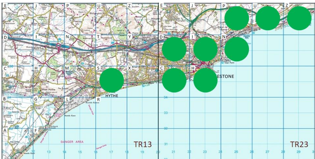
Figure 3: Distribution of all Serin records at Folkestone and Hythe by tetrad

Figure 3 shows the distribution of records by tetrad. Fifteen records have been at the cliffs, between Capel Battery and Abbotscliffe, with a further six at Copt Point and two at Samphire Hoe. The other sightings relate to singles at Folkestone Harbour, Mill Point, Cheriton and Hythe.