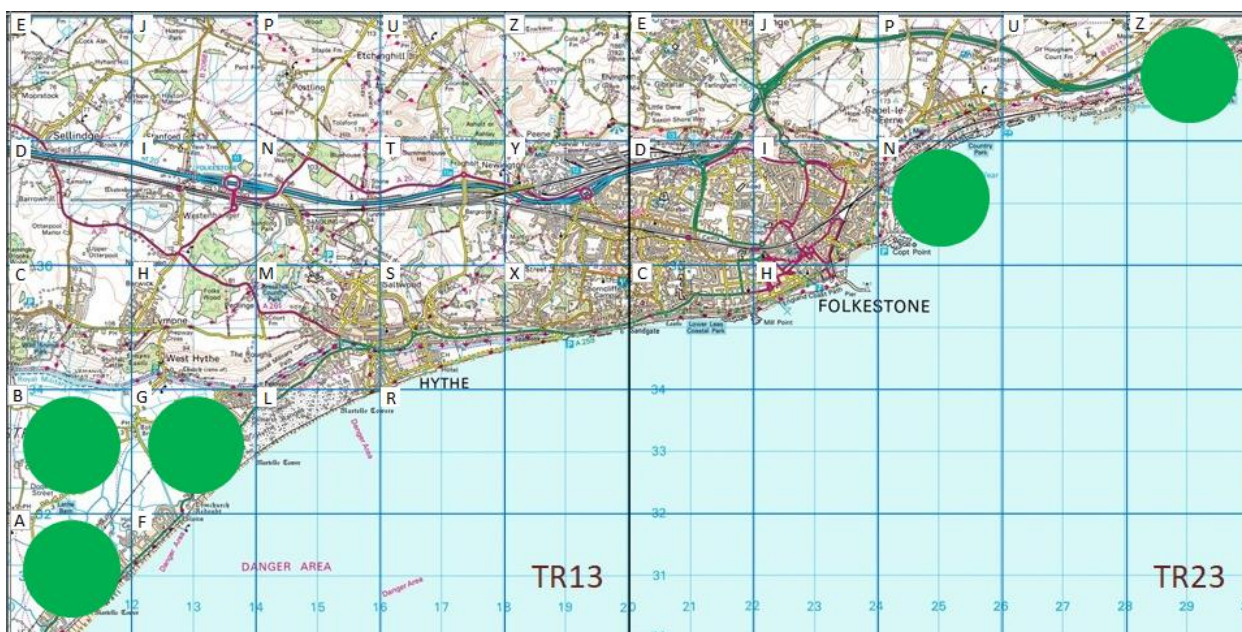
Figure 3: Distribution of all Water Pipit records at Folkestone and Hythe by tetrad