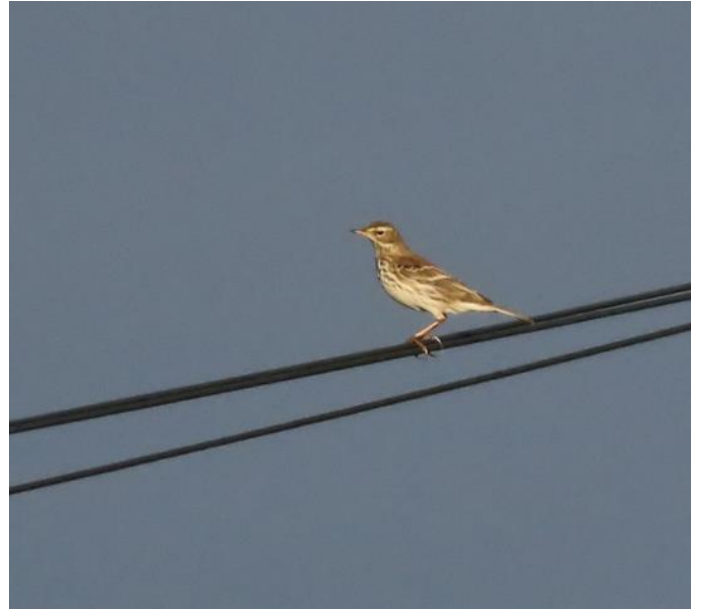
Water Pipit at Donkey Street (Brian Harper)