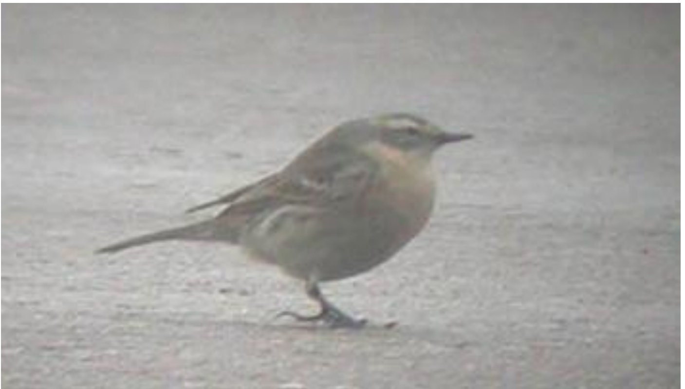
Water Pipit at Samphire Hoe