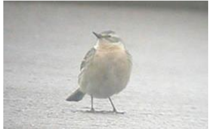
Water Pipit at Samphire Hoe (Geoff Burton)

Breeds in mountainous regions of central and southern Europe, often at considerable elevations above or at the edge of the tree line. In winter moves to lower ground throughout inland central Europe, north-west to Belgium and the Netherlands, with small numbers regularly in southern England (Snow & Perrins, 1998). In Kent it is an uncommon passage migrant and winter visitor, particularly to the Stour Valley (KOS, 2020).