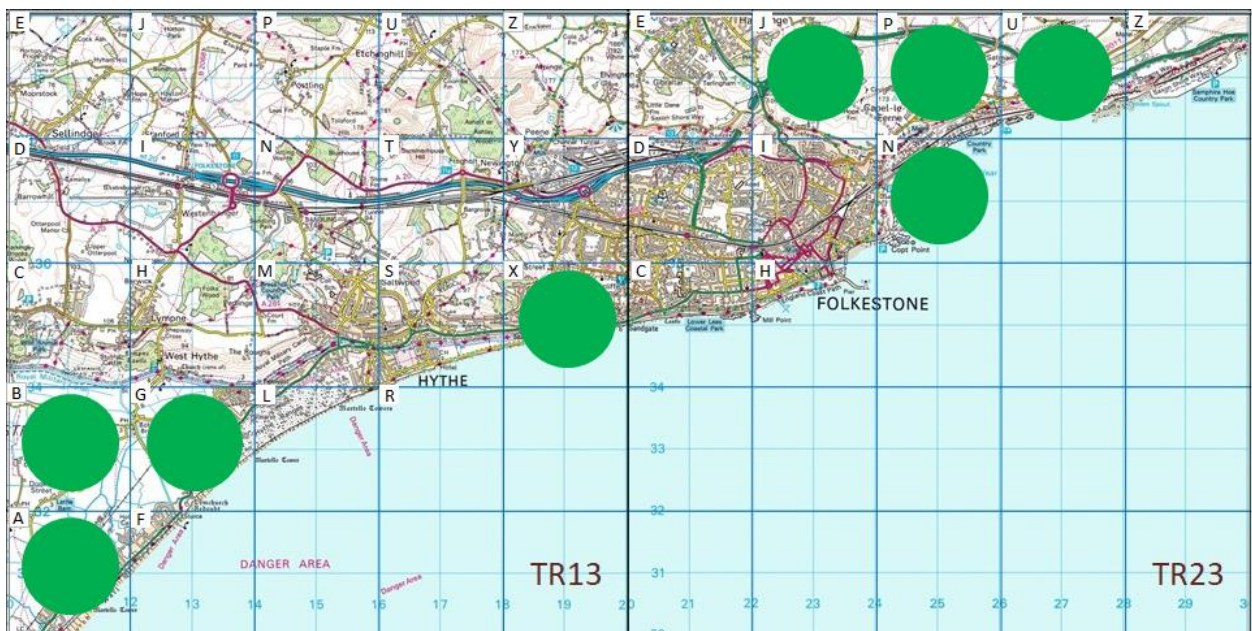
Figure 3: Distribution of all Ruff records at Folkestone and Hythe by tetrad

Figure 3 shows the distribution of records by tetrad. Most of the early records were from Nickolls Quarry but there have been no sightings there since 2003. The Willop Basin/Willop Sewage Works area has hosted eight of the ten most recent records.