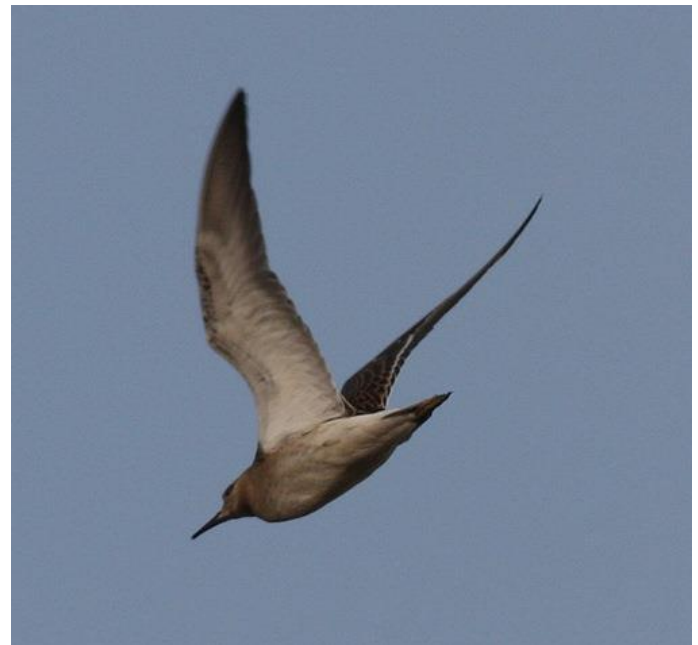
Ruff over Crete Road East

First recorded in the Folkestone and Hythe area in the old pit at Nickolls Quarry 1952, with further records in the Nickolls Quarry/West Hythe area in 1957 (two), 1958 (two) and 1960.