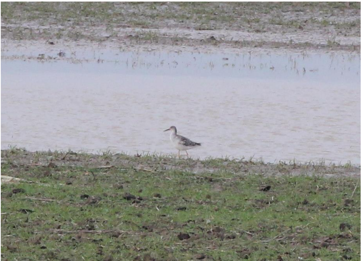
Ruff at the Willop Basin