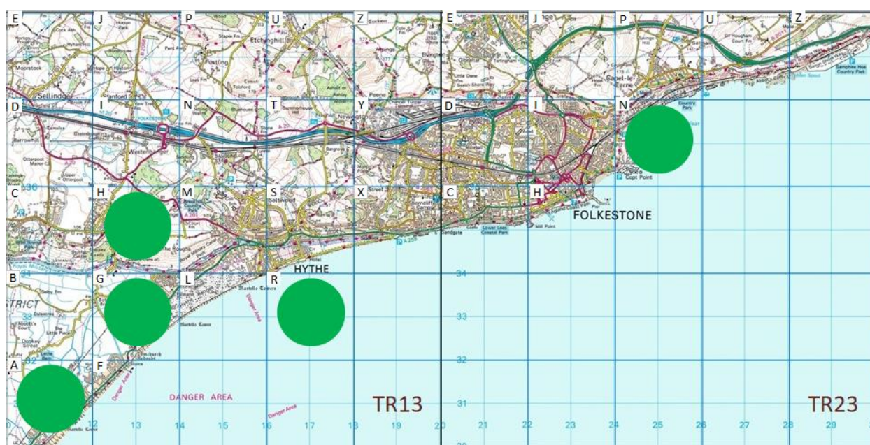
Figure 3: Distribution of all Smew records at Folkestone and Hythe by tetrad

Apart from a migrant which passed Copt Point on the 3 rd November, all have been recorded between the 24 th November (week 47) and 26 th February (week 9), with a peak arrival time of late January/early February, as shown in figure 2. The vast majority of records were associated with severe weather.