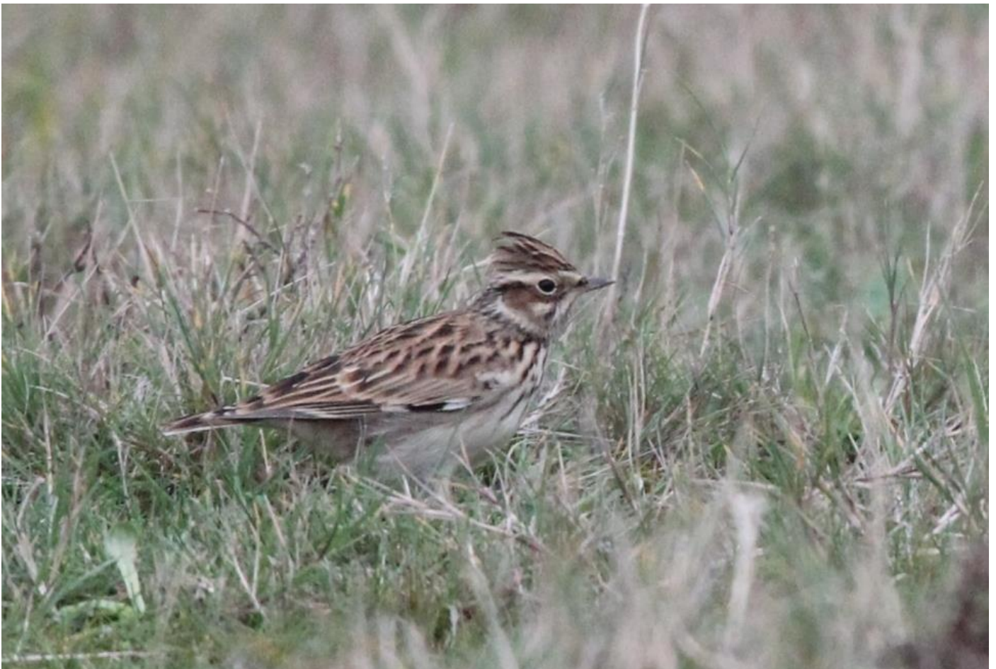
Wood Lark at Samphire Hoe