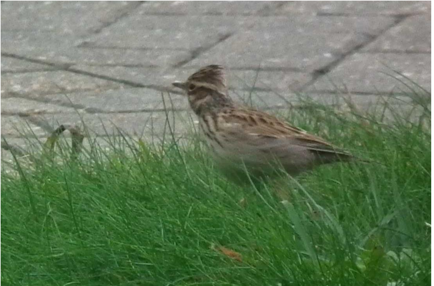
Wood Lark at Samphire Hoe (Paul Holt)