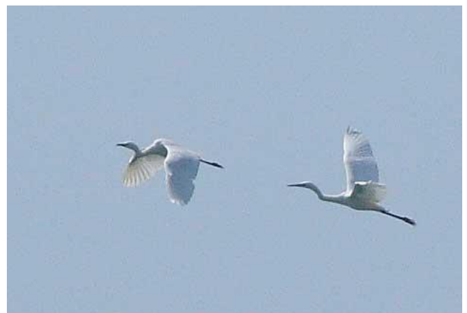
Great White Egrets at Samphire Hoe (Colin Fisher)