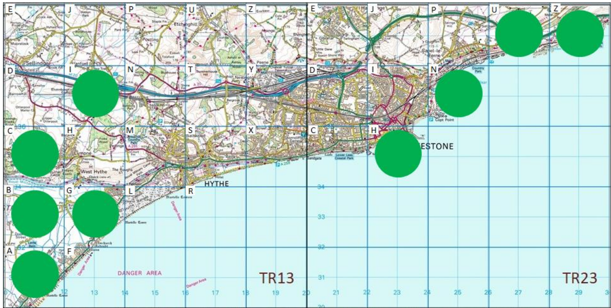
Figure 3: Distribution of all Great White Egret records at Folkestone and Hythe by tetrad