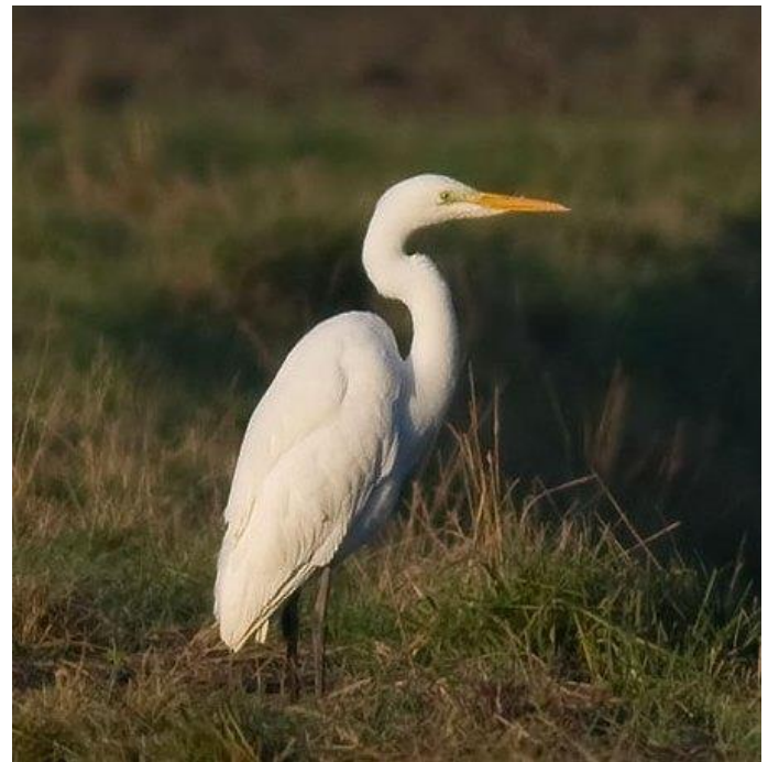
Great White Egret at Botolph's Bridge

In Kent it was a former vagrant, and is now a regular annual visitor, predominately during the winter months (KOS, 2020). There had only been nine records in the county before 2002 (KOS, 2020) but it has occurred annually since and by 2017 up to 20 could be seen at Dungeness during the autumn.