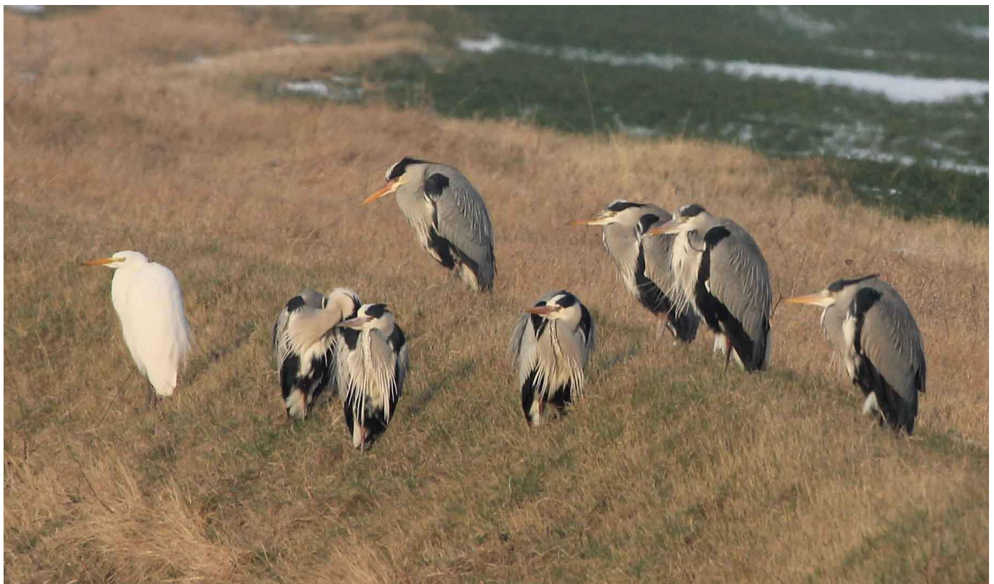
Great White Egret with Grey Herons at West Hythe (Ian Roberts)

The tetrad map images were produced from the Ordnance Survey Get-a-map service and are reproduced with kind permission of Ordnance Survey .