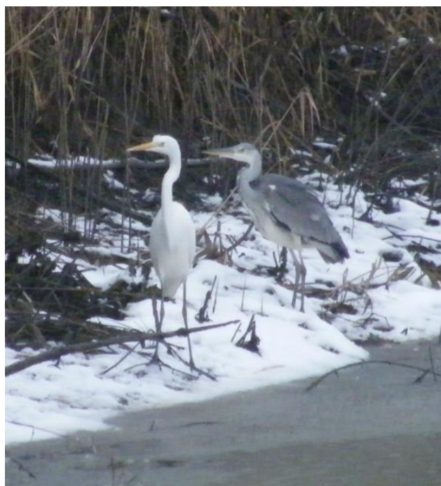
Great White Egret with Grey Heron at West Hythe

The record was accepted by KOS rarities committee.