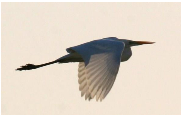
Great White Egret at West Hythe (Dale Gibson)

One flew east over Donkey Street on the 18 th November and up to two were present there between the 26 th and 28 th December 2018 with at least one remaining until the 2 nd April 2019, and there were four further records in 2019. In 2020 one was seen at West Hythe on the 19 th February, singles flew in off the sea at Capel-le-Ferne Gun Site on the 11 th September and Abbotscliffe on the 12 th October, whilst one was seen in the Aldergate Bridge/Donkey Street area from the 7 th October.