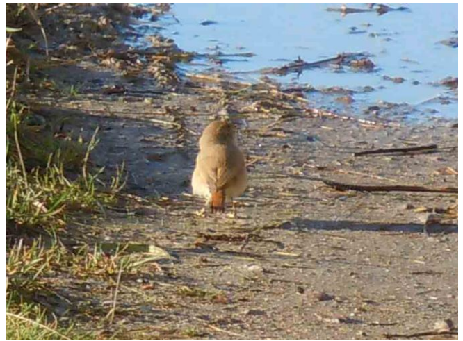
Asian Desert Warbler at Samphire Hoe (Roger Card)

It is a very rare vagrant to Britain with 11 records prior to the one at Samphire Hoe (most recently in 2000). All of the previous records were on the eastern or southern coasts of England between Yorkshire and Devon (apart from one in Cheshire), with one in Kent – at Seasalter in November 1991.