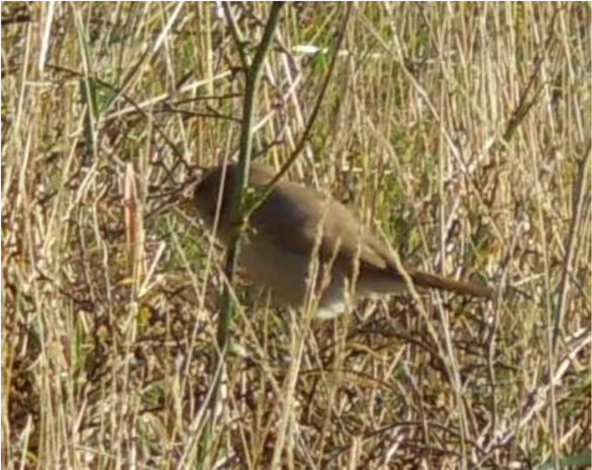
Asian Desert Warbler at Samphire Hoe (Roger Card)