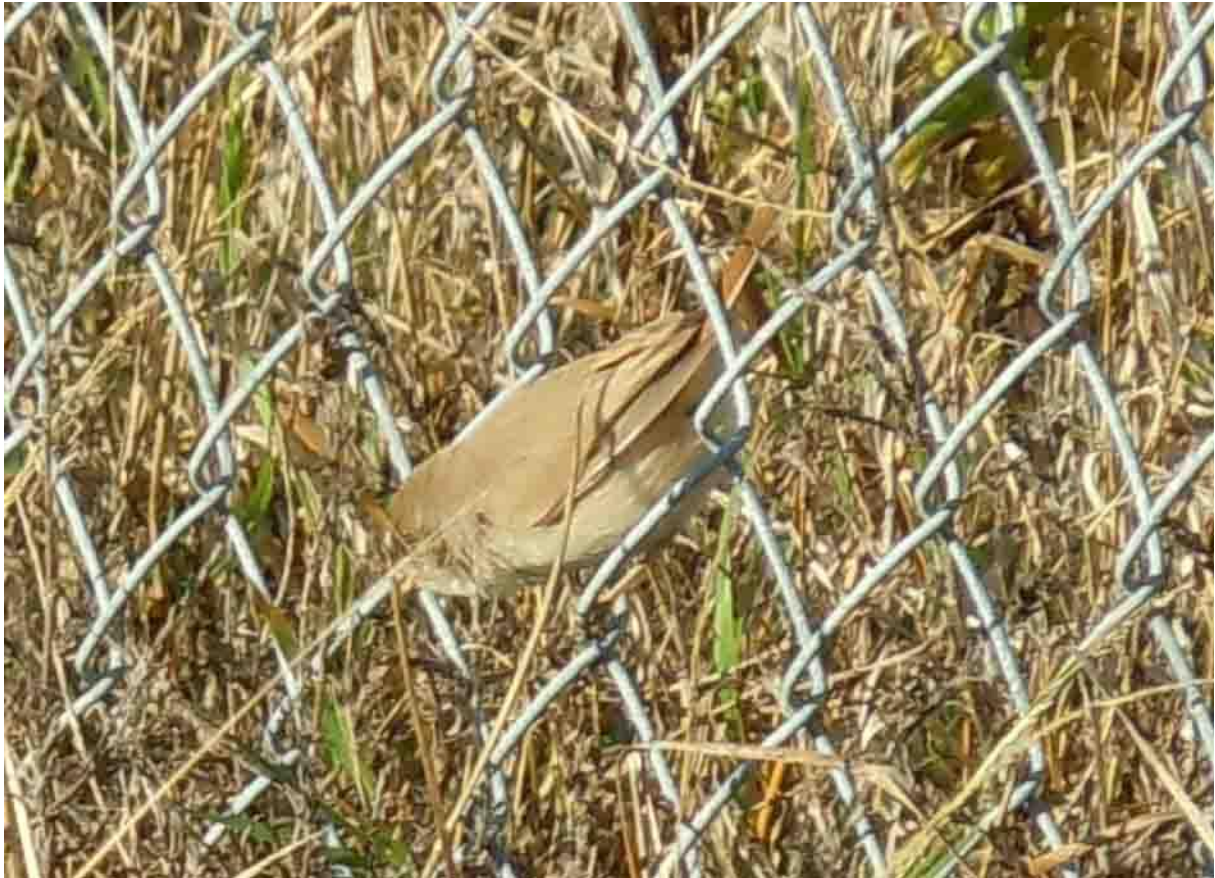
Asian Desert Warbler at Samphire Hoe (Roger Card)

The record was accepted by the British Birds Rarities Committee and appears in their annual report for 2012 (British Birds: 106, p. 612).