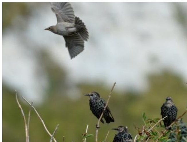
Rose-coloured Starling at Samphire Hoe

Within the Western Palearctic the core of its range is in Russia and Turkey, with smaller numbers into Greece and Albania. However it is an erratic, irruptive visitor to central and western Europe, with occasional breeding to the west of the usual limits, including an exceptional influx to the Hortobágy area of Hungary in 1995 when up to 1,700 pairs bred. It is an annual vagrant to Britain, mostly involving adults in late spring or early summer and juveniles in autumn. There had been 486 records nationally to the end of 2001 when the British Birds Rarities Committee removed it from the list of species which it assessed.