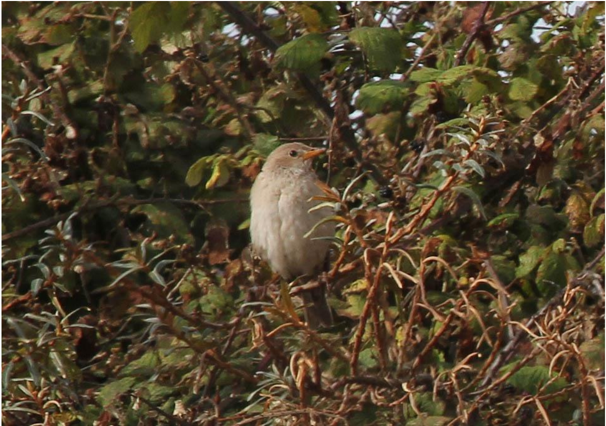
Rose-coloured Starling at Samphire Hoe