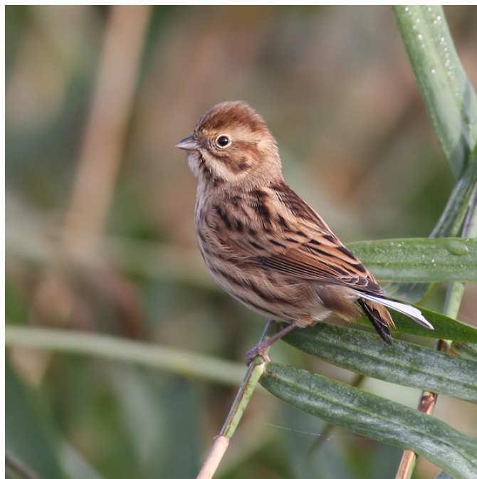
Reed Bunting at Botolph's Bridge (Brian Harper)

The full species account will follow but the breeding and wintering distribution maps based on the 2007 – 2012 BTO / KOS atlas are provided below.