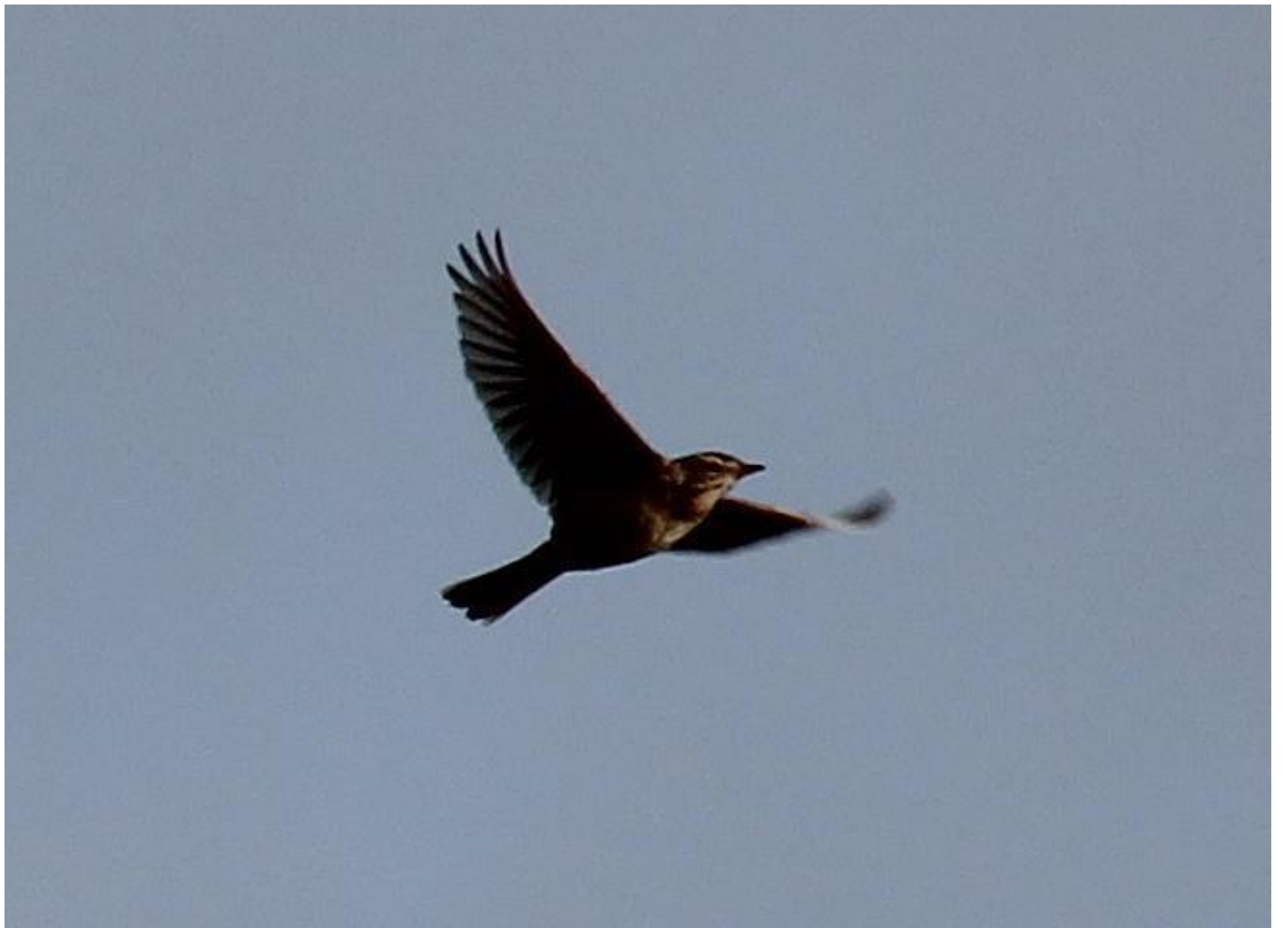
Richard's Pipit at Abbotscliffe