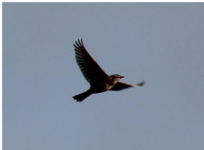
Richard's Pipit at Abbotscliffe

A rare but regular passage migrant to Kent, particularly in the autumn. There had been 119 county records to the end of 2010, 55% of which were in the last twenty years.