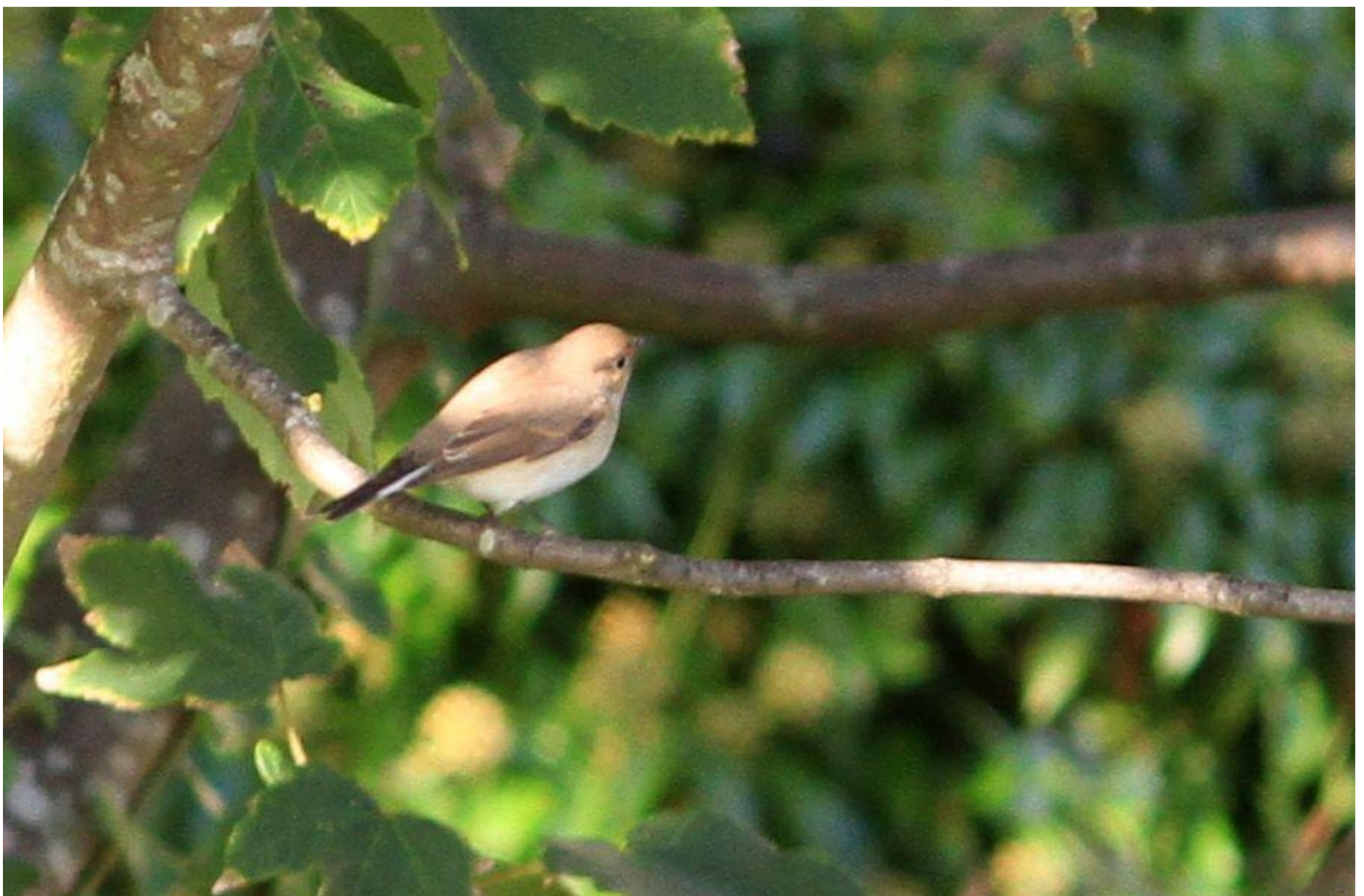
Red-breasted Flycatcher at Samphire Hoe