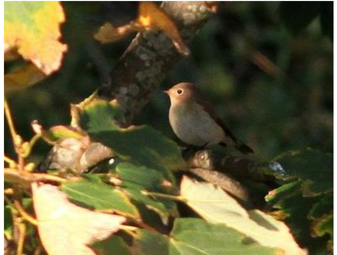
Red-breasted Flycatcher at Samphire Hoe

A scarce autumn migrant to Kent, very rare in spring. The first county record was an inland bird near Bough Beech in 1943, with a further 121 to the end of 2009. There were 88 records between 1970 and 1999, at a rate of 2.9 per year, but only 9 records in the most recent decade (a rate of 0.9 per year), which suggests a recent decline.