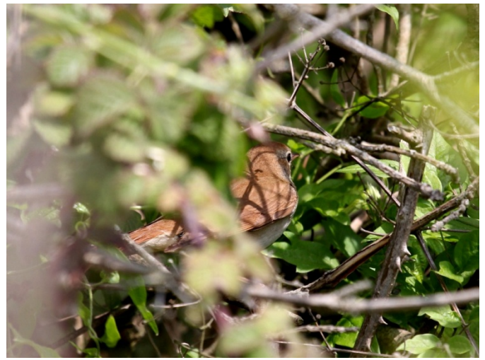
Nightingale at Folkestone Warren (Dale Gibson)

The full species account will follow but the breeding and wintering distribution maps based on the 2007 – 2012 BTO / KOS atlas are provided below.