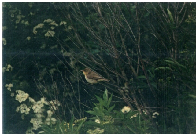
Melodious Warbler at Capel-le-Ferne (Dale Gibson)

Breeds in France, Iberia, Italy and the north coasts of Morocco and Tunisia. Very little overlap with range of Icterine Warbler which occupies the more northern and eastern parts of Europe, though Melodious Warbler does appear to be expanding into Belgium, Luxembourg, Germany and Switzerland. Winters in west Africa.