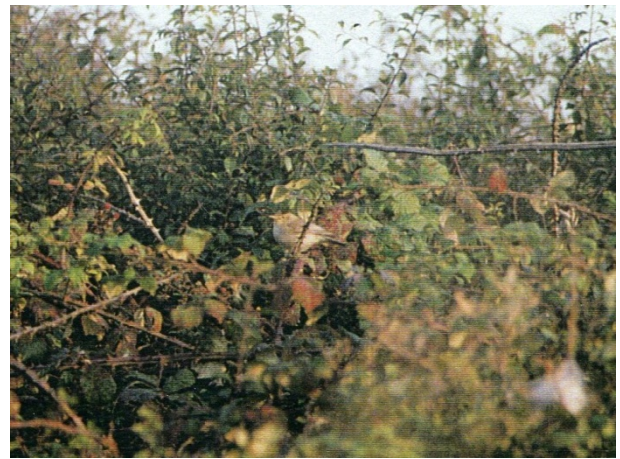
Icterine Warbler at Abbotscliffe (Dale Gibson)

Breeds in middle and upper latitudes across Europe, from northern France, through the Low Countries, into Fenno-Scandia, and east through central Europe into Russia. Also extends south-east to the Black Sea. Very little overlap with range of Melodious Warbler which occupies the south-west of Europe. Winters in sub-Saharan Africa, chiefly south of equator.