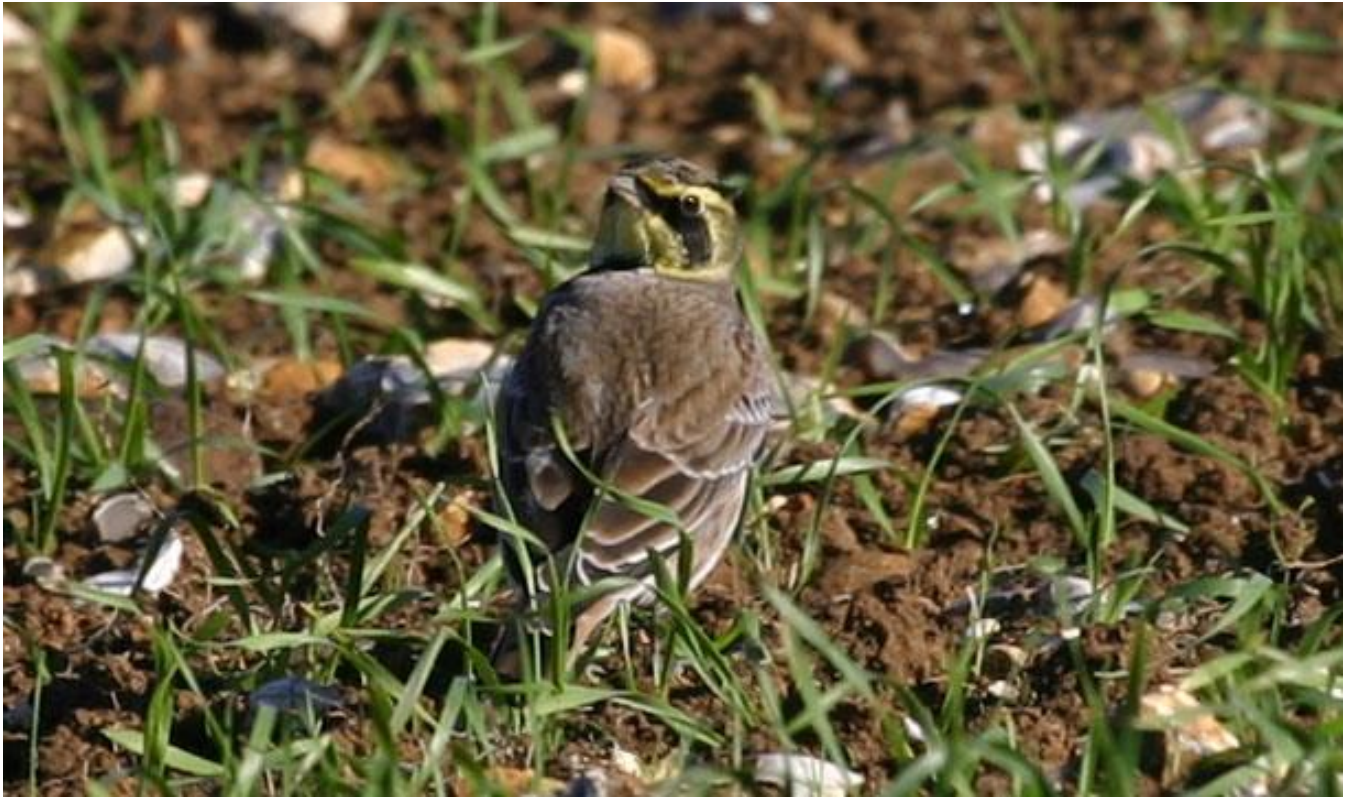
Shore Lark at Abbotscliffe