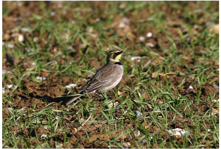
Shore Lark at Abbotscliffe (Ian Roberts)

A passage migrant and winter visitor to Kent, usually in small numbers.