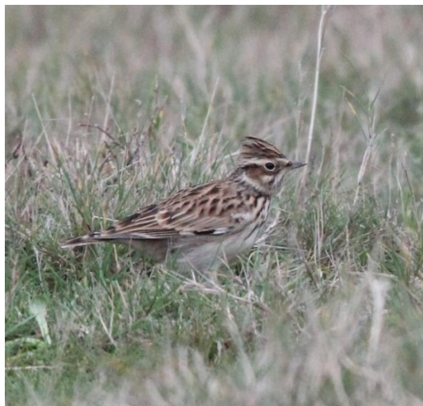
Wood Lark at Samphire Hoe